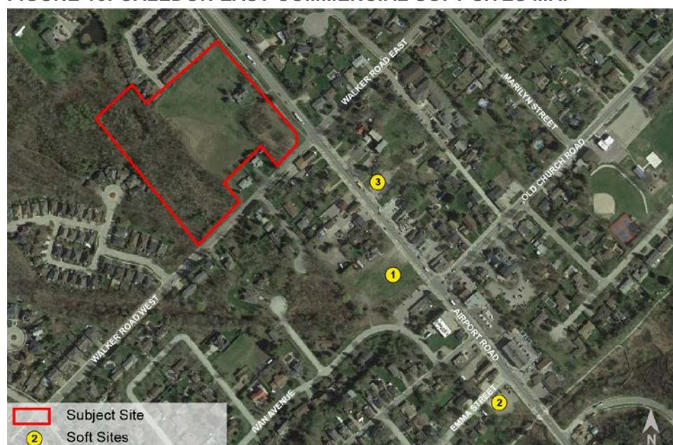
FIGURE 10: CALEDON EAST COMMERCIAL SOFT SITES MAP