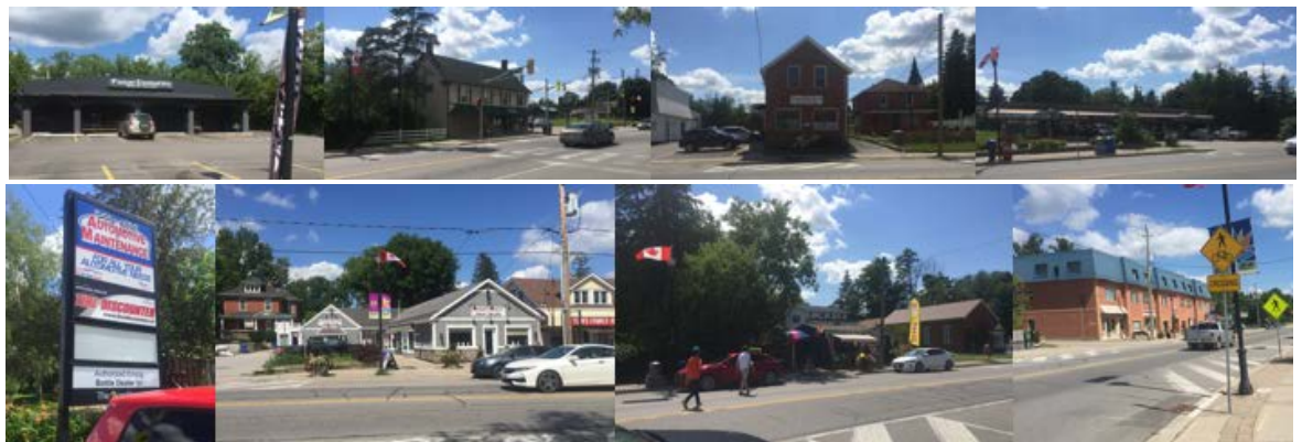
FIGURE 6: EXAMPLES OF CALEDON EAST RETAIL

Node 3: Other, accounts for all other retail/commercial space in Caledon East. Node 3 is smallest node, accounting for 7,700 sf or 8.5% of all retail/commercial space in the community. NFBR is the largest retail category, accounting for 5,000 sf or 64.9% of all space in Node 3. This is followed by Service Space, which accounts for 2,700 sf or 35.1% of space. There is no FBR or vacant commercial space in Node 3.