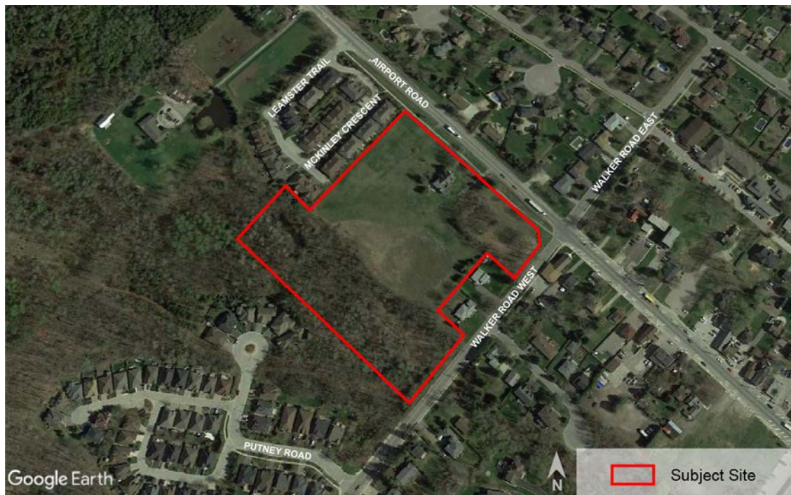
FIGURE 1: CALEDON EAST LAND USE PLAN