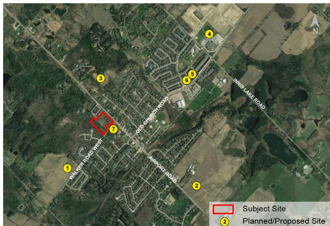
FIGURE 8: CALEDON EAST PLANNED AND PROPOSED DEVELOPMENT MAP