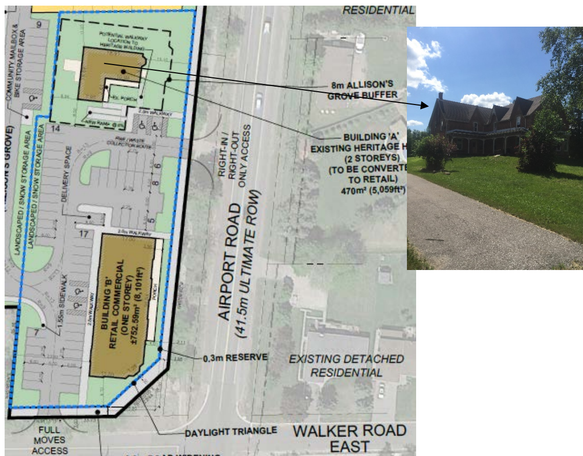
FIGURE 3: PROPOSED RETAIL/COMMERCIAL PLAZA