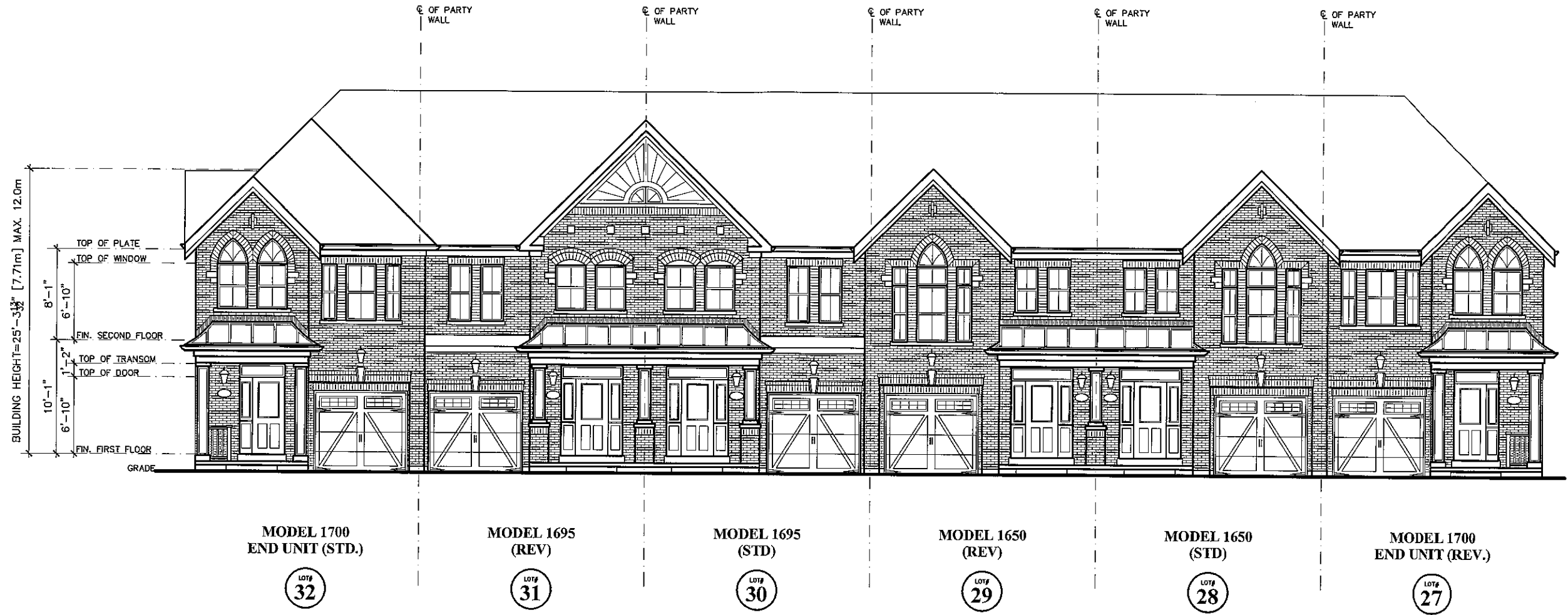
FRONT ELEVATION A BLOCK 5