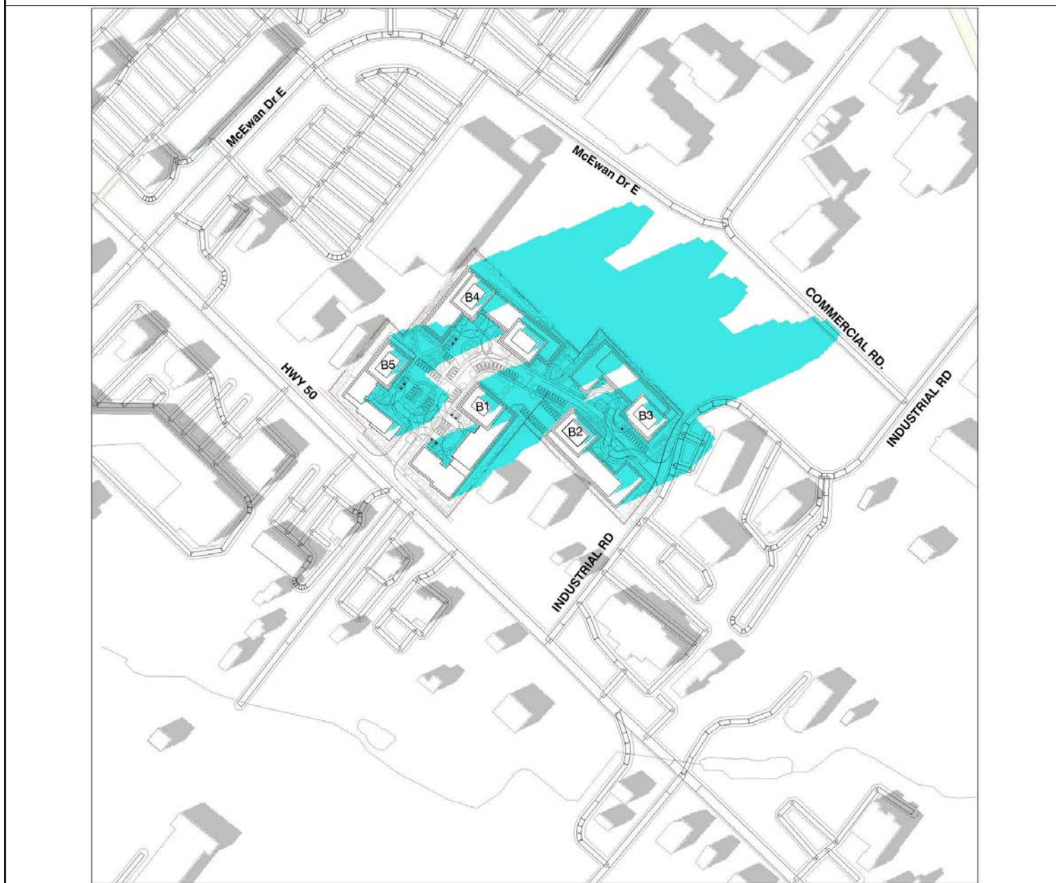
MARCH 21st 5:18PM 9 A701