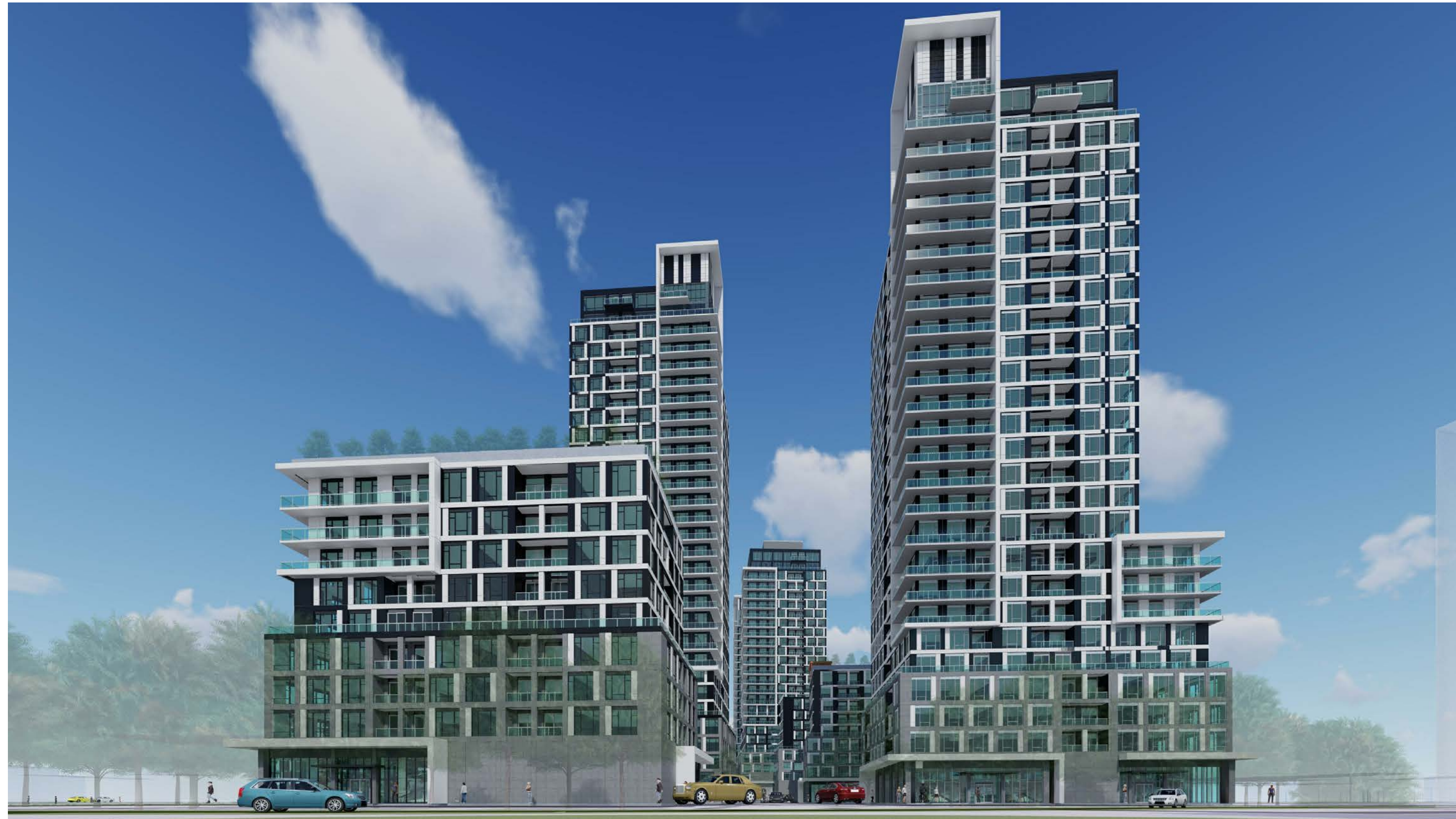
THE DEVELOPMENT ACCESS FROM THE INDUSTRIAL RD. 4 NTS A605