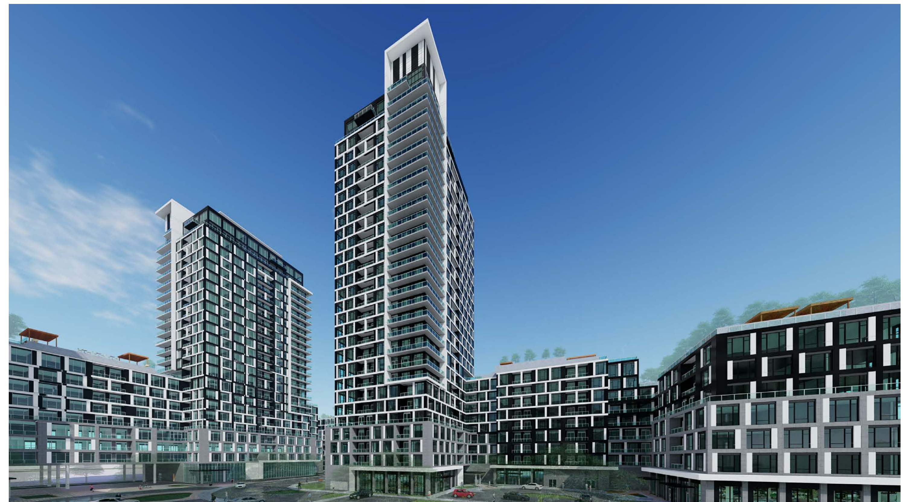
PEDESTRIAN VIEW OF B1 FROM B5 DROP-OFF 1 NTS A605

THESE DRAWINGS ARE NOT TO BE SCALED: ALL DIMENSIONS MUST BE VERIFIED BY CONTRACTOR PRIOR TO COMMENCEMENT OF ANY WORK. ANY DISCREPANCIES MUST BE REPORTED DIRECTLY TO SRN ARCHITECTS INC.