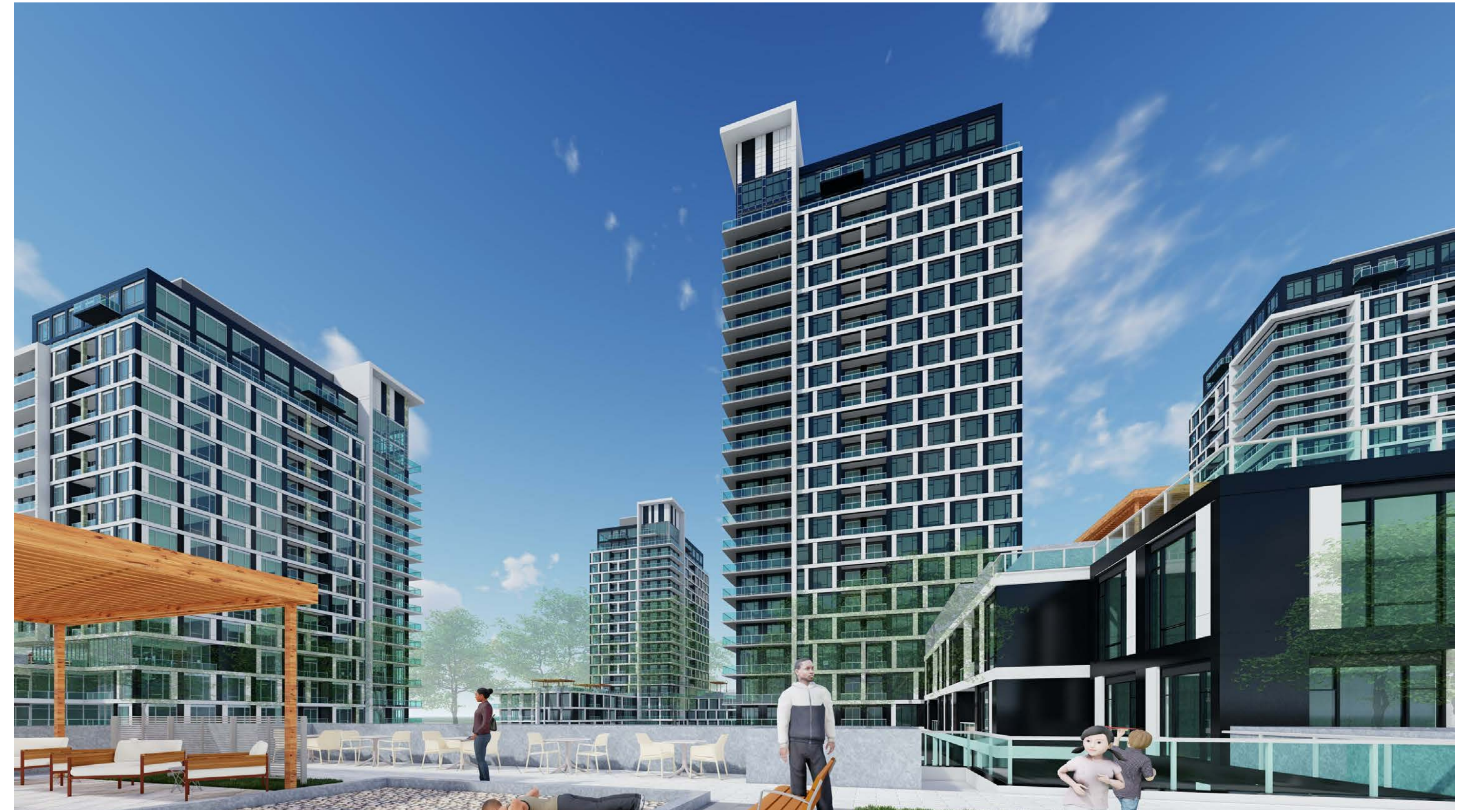
VIEW FROM B1 ROOFTOP AMENITY @ LEVEL 9 3 NTS A605