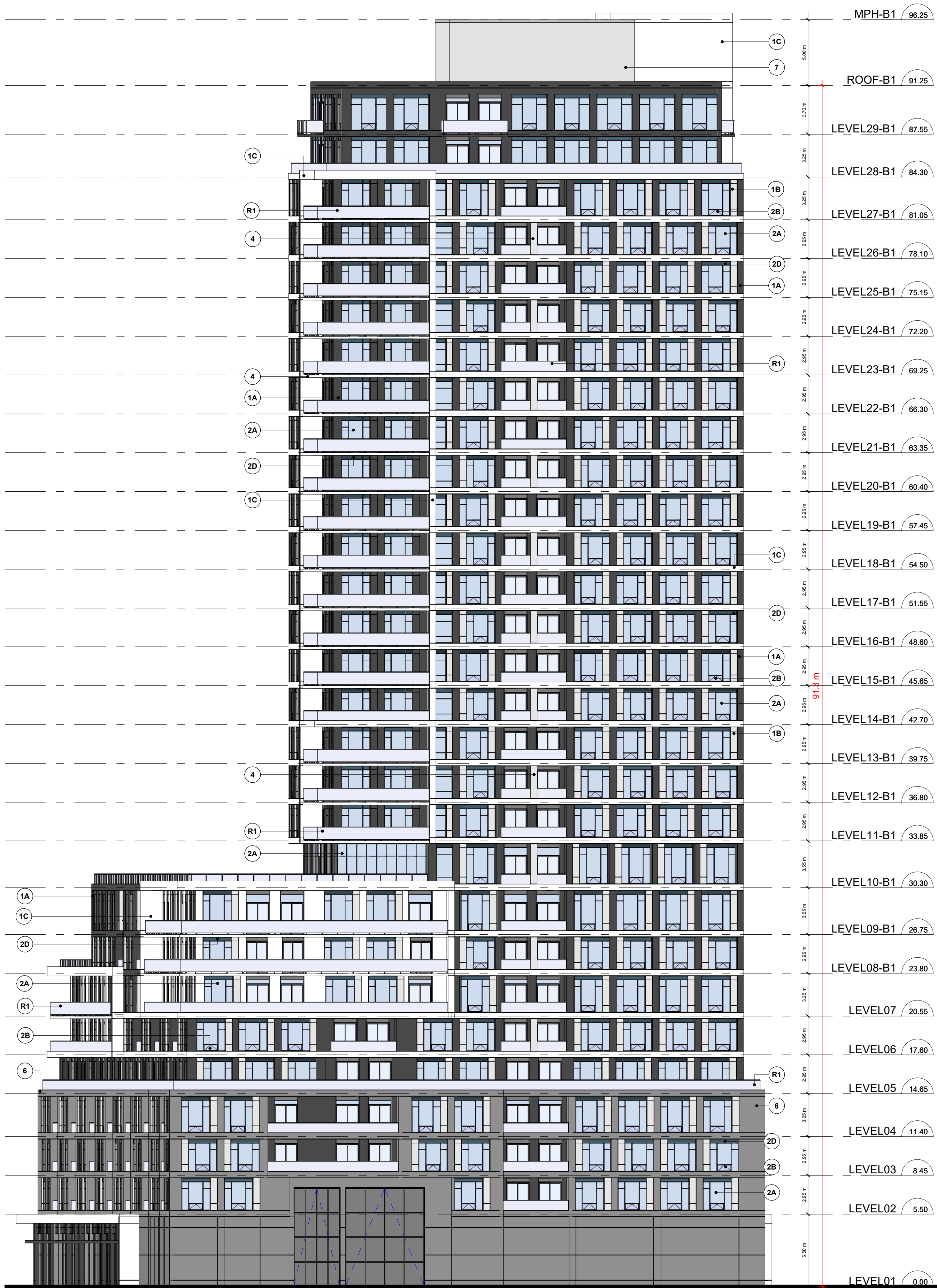
B1 NORTH ELEVATION