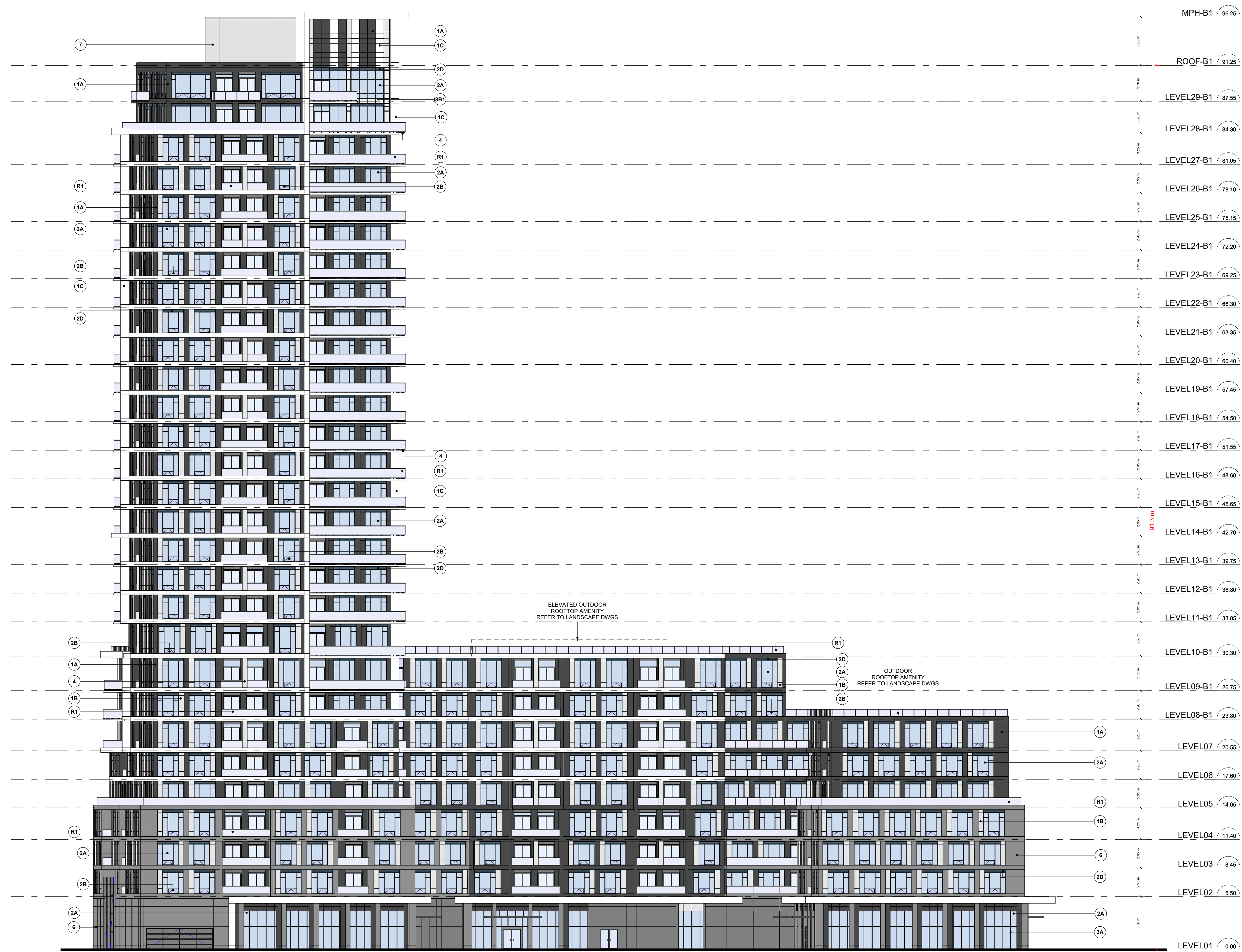
B1 WEST ELEVATION 1 Scale: 1 : 200 A410