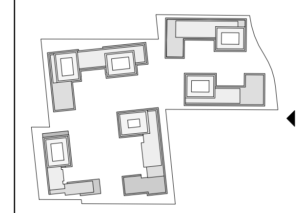
KEY PLAN 1:4000

CONDITIONS FOR ELECTRONIC INFORMATION TRANSFER: ELECTRONIC INFORMATION IS SUPPLIED TO THE OTHER ASSOCIATED FIRMS TO ASSIST THEM IN THE ERECTION OF THEIR WORK/REVIEW. THE RECIPIENT FIRMS MUST DETERMINE THE COMPLETENESS/APPROPRIATENESS/ RELEVANCE OF THE INFORMATION IN RESPECT TO THEIR PARTICULAR RESPONSIBILITY.