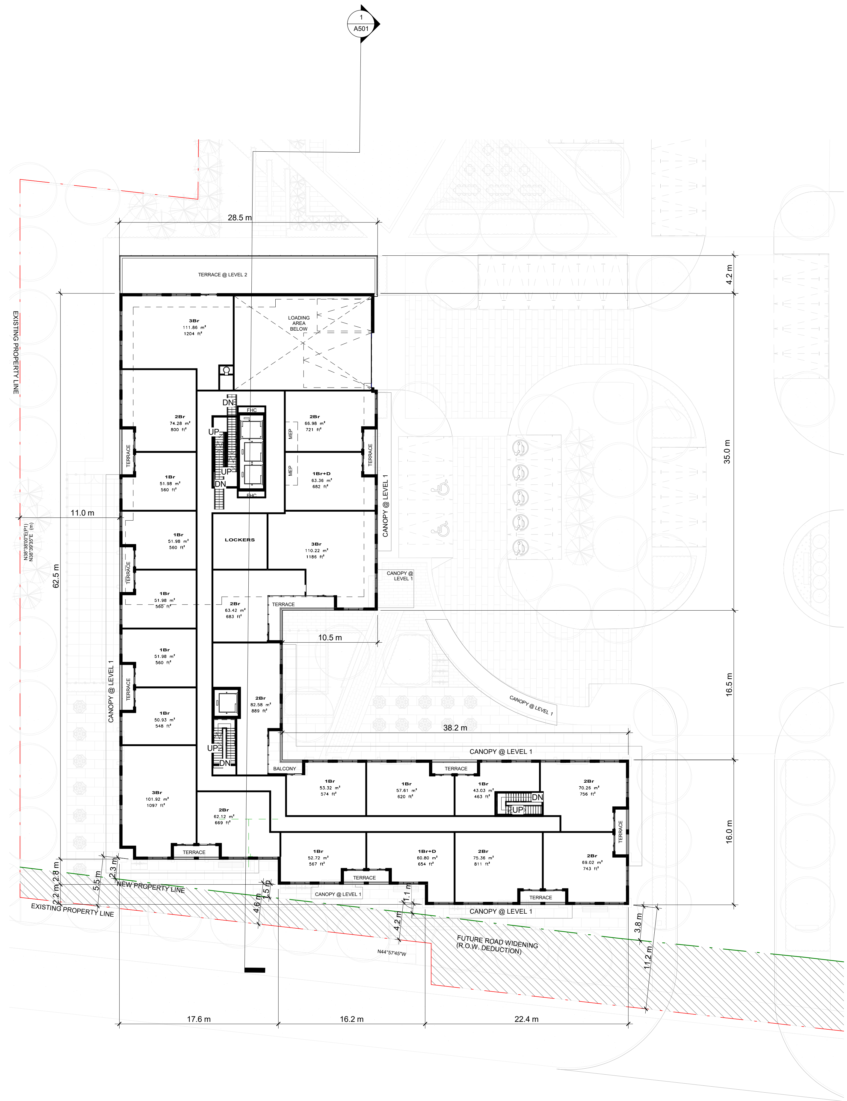
B5_LEVEL 02_FLOOR PLAN 2 Scale: 1 : 250 A351

THESE DRAWINGS ARE NOT TO BE SCALED: ALL DIMENSIONS MUST BE VERIFIED BY CONTRACTOR PRIOR TO COMMENCEMENT OF ANY WORK. ANY DISCREPANCIES MUST BE REPORTED DIRECTLY TO SRN ARCHITECTS INC.