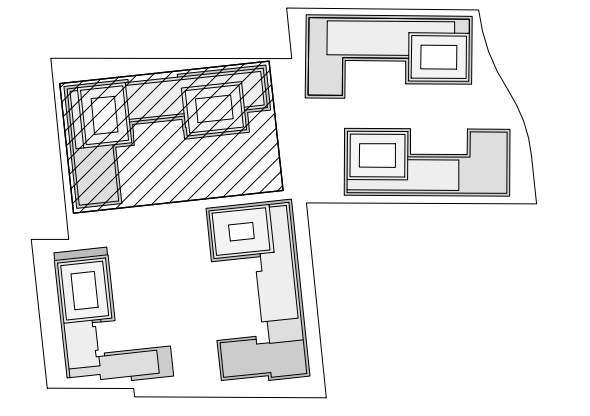
KEY PLAN 1:4000

ADDITIONAL NOTES: THE DRAWING, AS AN INSTRUMENT OF SERVICE, IS PROVIDED BY AND IS THE PROPERTY OF SRN ARCHITECTS INC. THE CONTRACTOR MUST VERIFY AND ACCEPT RESPONSIBILITY FOR ALL DIMENSIONS AND CONDITIONS ON SITE AND MUST NOTIFY SRN ARCHITECTS INC. OF ANY VARIATIONS FROM THE SUPPLIED INFORMATION. SRN ARCHITECTS INC. IS NOT RESPONSIBLE FOR THE ACCURACY OF SURVEY, STRUCTURAL, MECHANICAL, ELECTRICAL, ETC. ENGINEERING INFORMATION SHOWN ON THIS DRAWING REFER TO APPROPRIATE ENGINEERS DRAWINGS BEFORE PROCEEDING WITH ANY WORK. CONSTRUCTION MUST CONFORM TO ALL APPLICABLE CODES AND REQUIREMENTS OF THE AUTHORITIES HAVING JURISDICTION (UNLESS OTHERWISE NOTED). NO INVESTIGATION HAS BEEN OR REPORTED ON BY THIS OFFICE IN REGARDS TO THE ENVIRONMENTAL CONDITION OF THIS SITE. CONDITIONS FOR ELECTRONIC INFORMATION TRANSFER: ELECTRONIC INFORMATION IS SUPPLIED TO THE OTHER ASSOCIATED FIRMS TO ASSIST THEM IN THE EXECUTION OF THEIR WORKREVIEW. THE RECIPIENT FIRMS MUST DETERMINE THE COMPLETENESS/APPROPRIATENESS/ RELEVANCE OF THE INFORMATION IN RESPECT TO THEIR PARTICULAR RESPONSIBILITY.