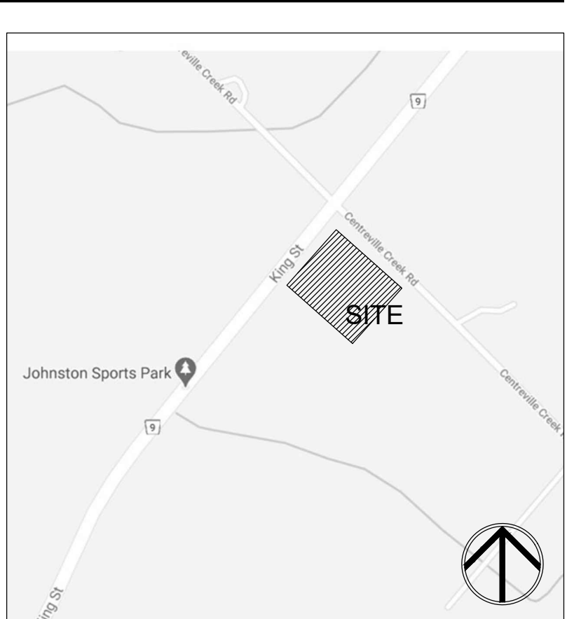
Context Plan 1:2000