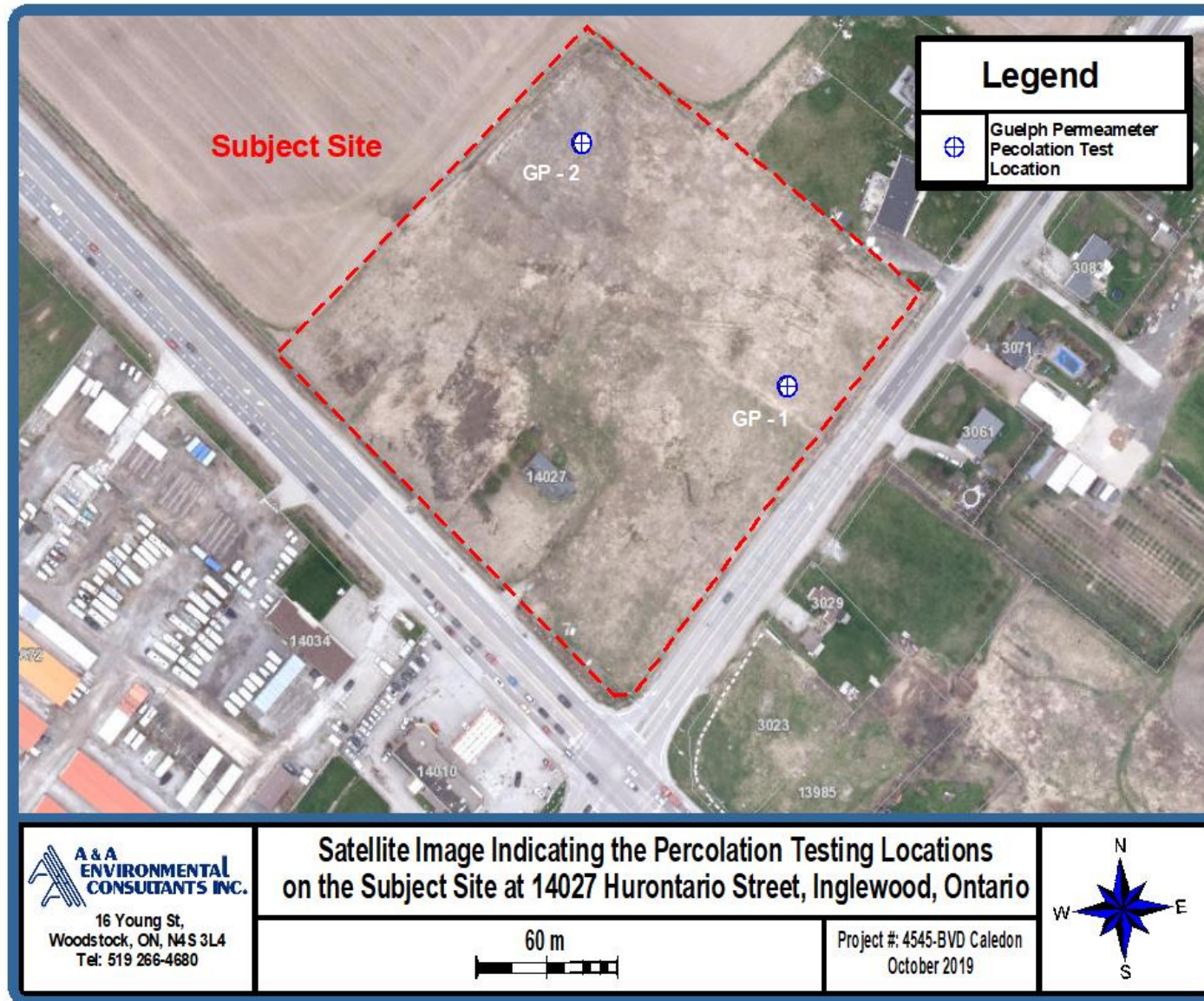
Figure 1 – Guelph Permeameter Testing Locations