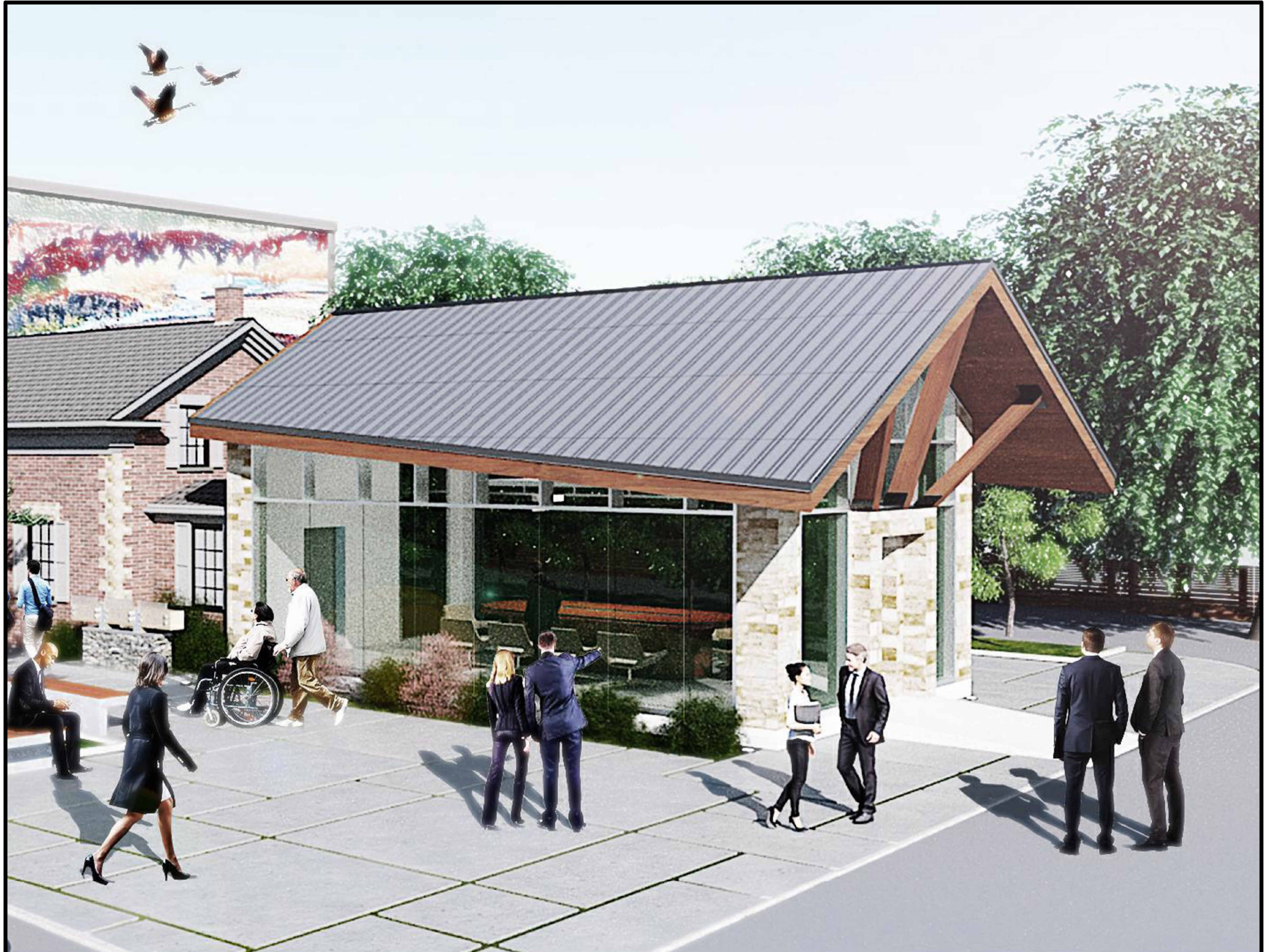
VIEW 1-FACING BUILDING H