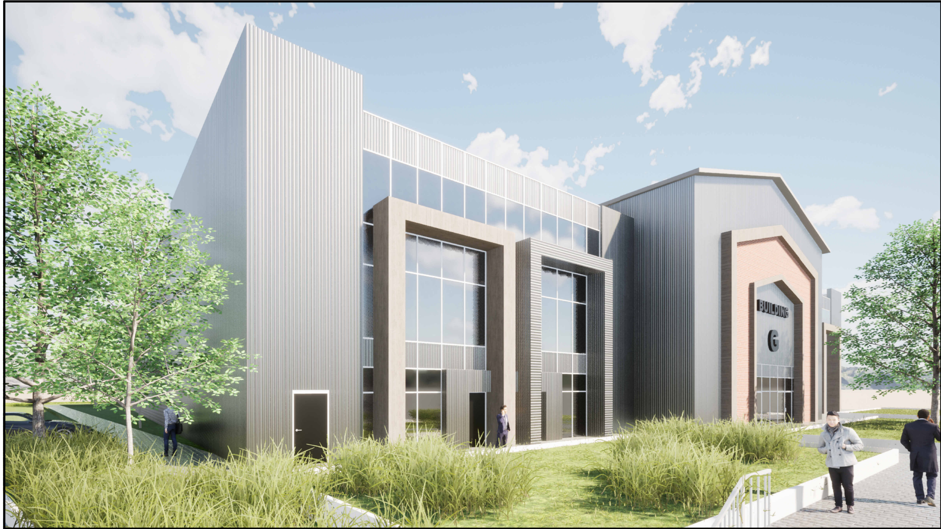
VIEW 1-FACING BUILDING G