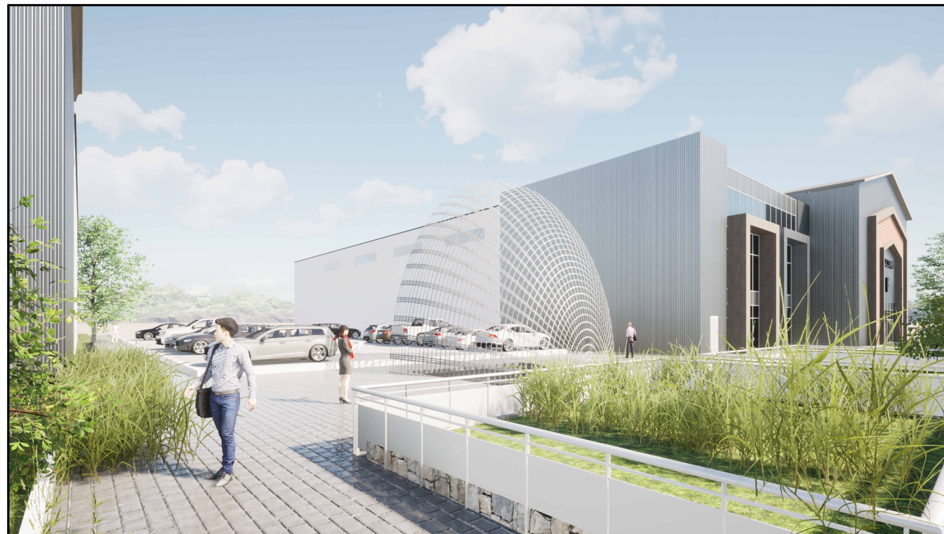
VIEW 1-FACING BUILDING F