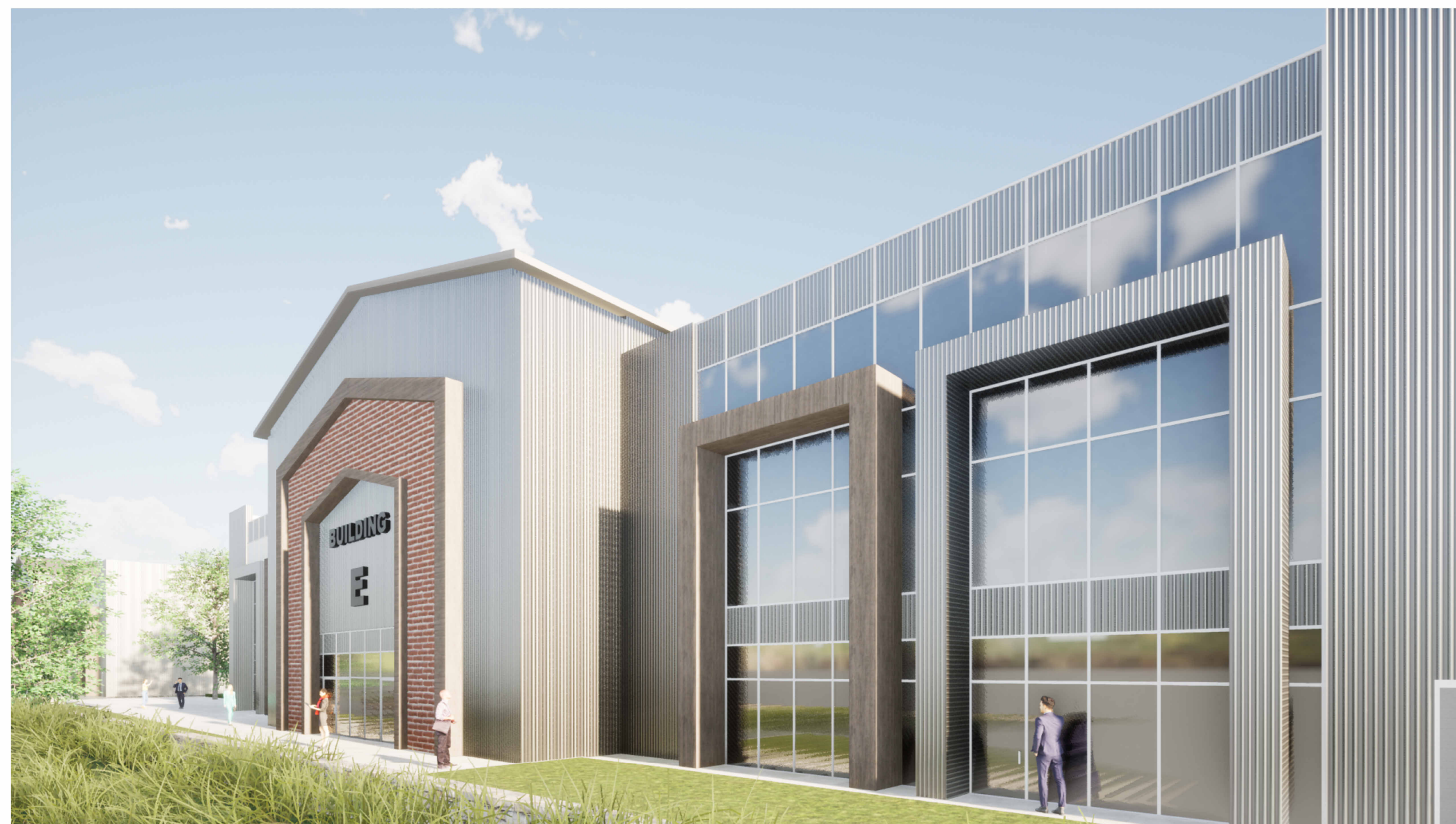
VIEW 1-FACING BUILDING E