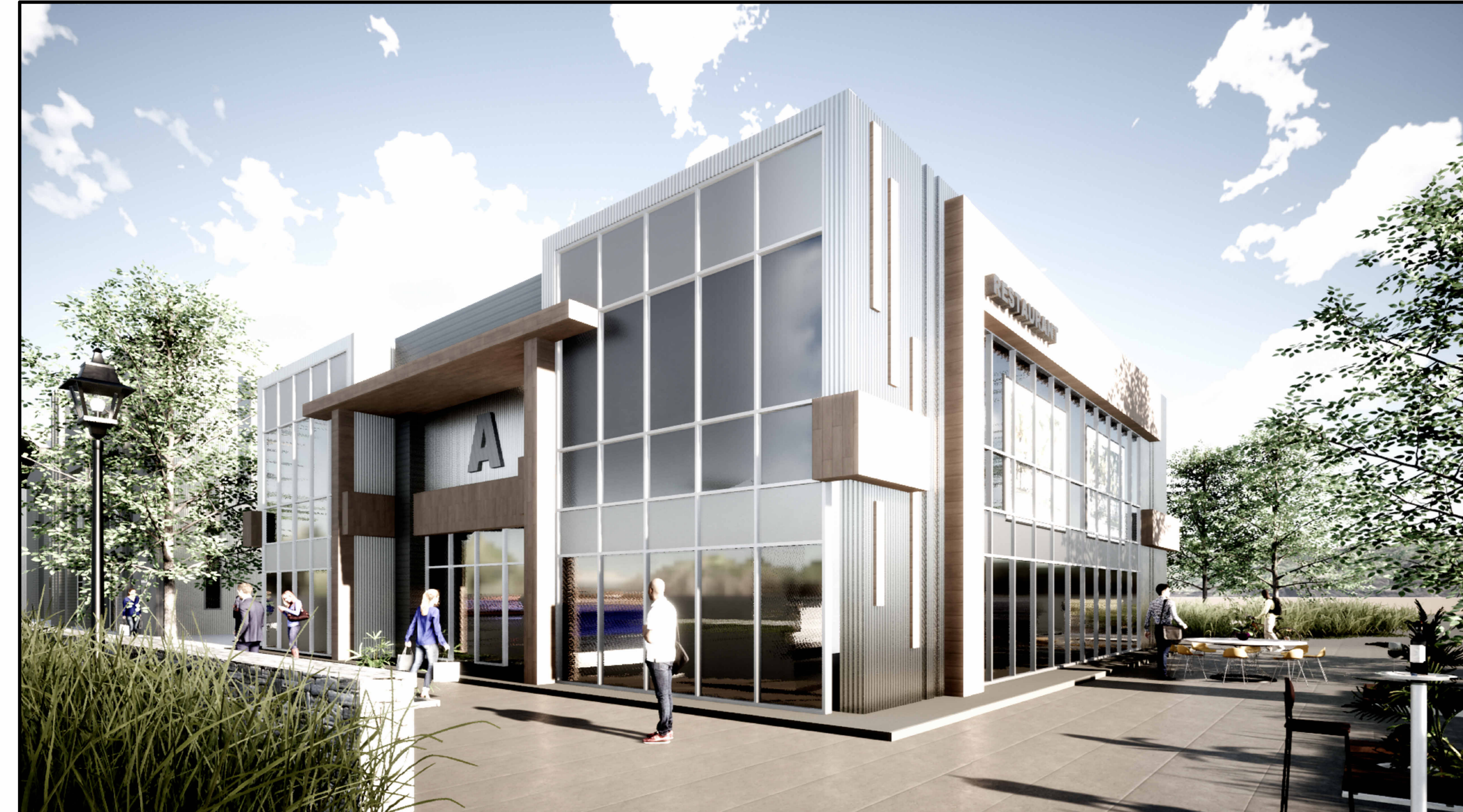
VIEW 1-FACING BUILDING A