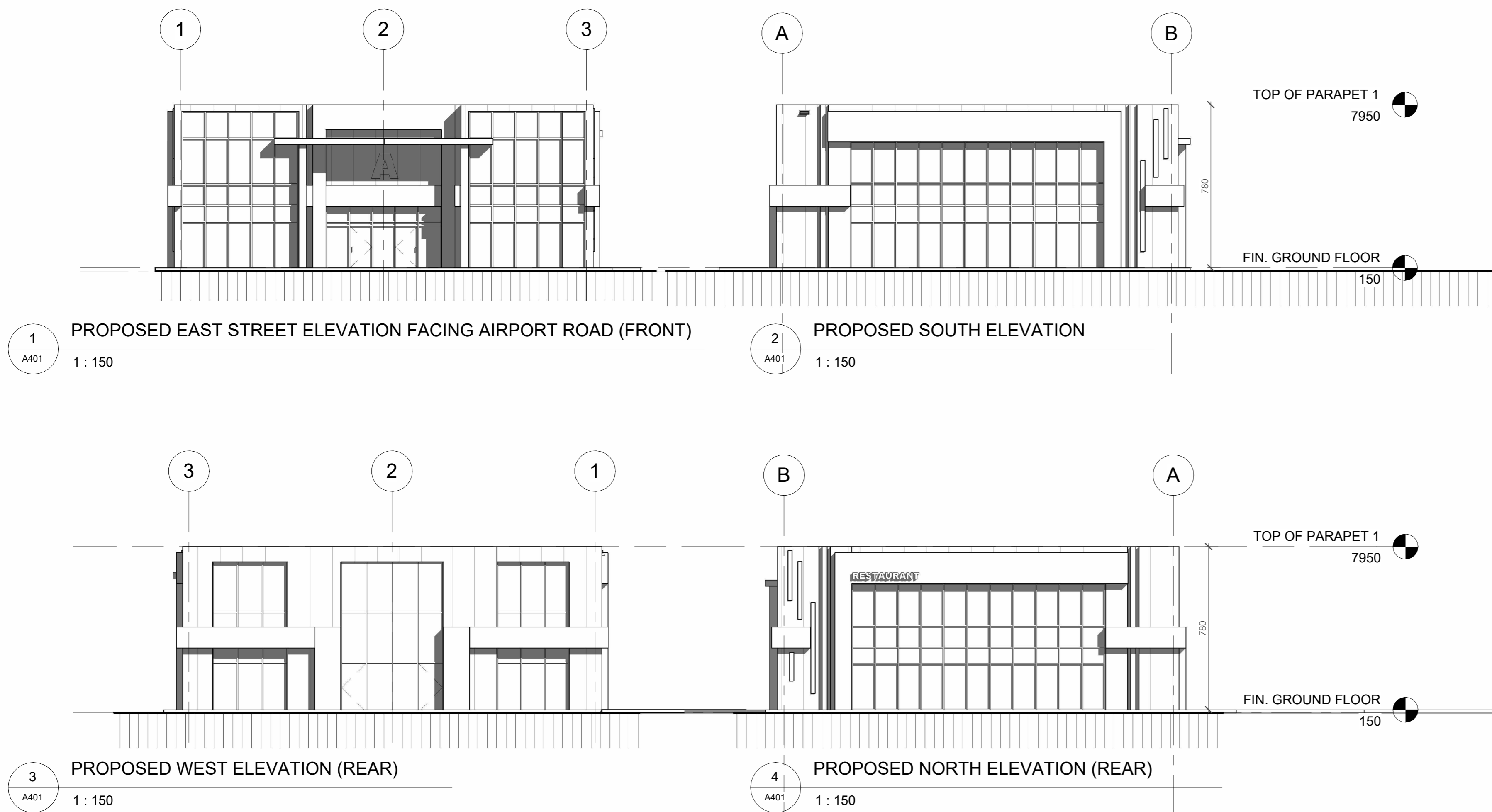
1 PROPOSED EAST STREET ELEVATION FACING AIRPORT ROAD (FRONT) A401 1: 150