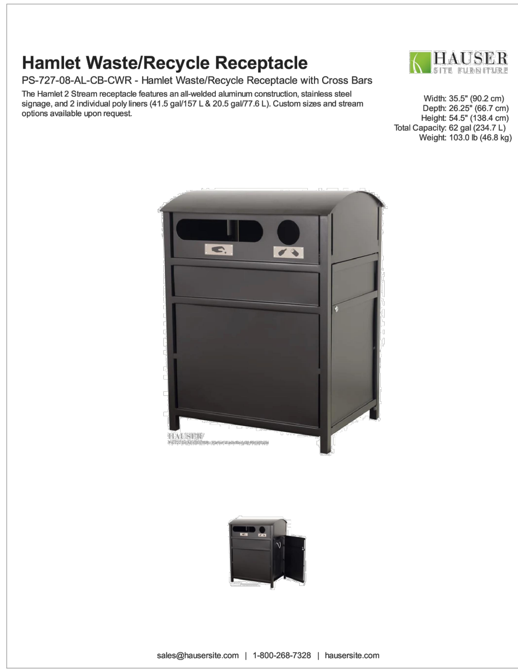
7 WASTE/ RECYCLE RECEPTACLE DETAIL SCALE: N.T.S.

TOWN OF CALEDON PLANNING RECEIVED Mar 23, 2023