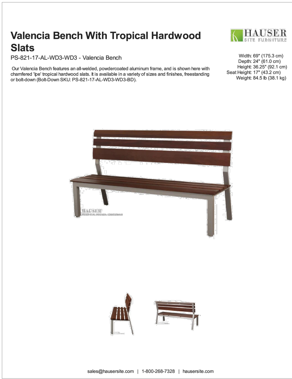
6 BENCH DETAIL SCALE: N.T.S.