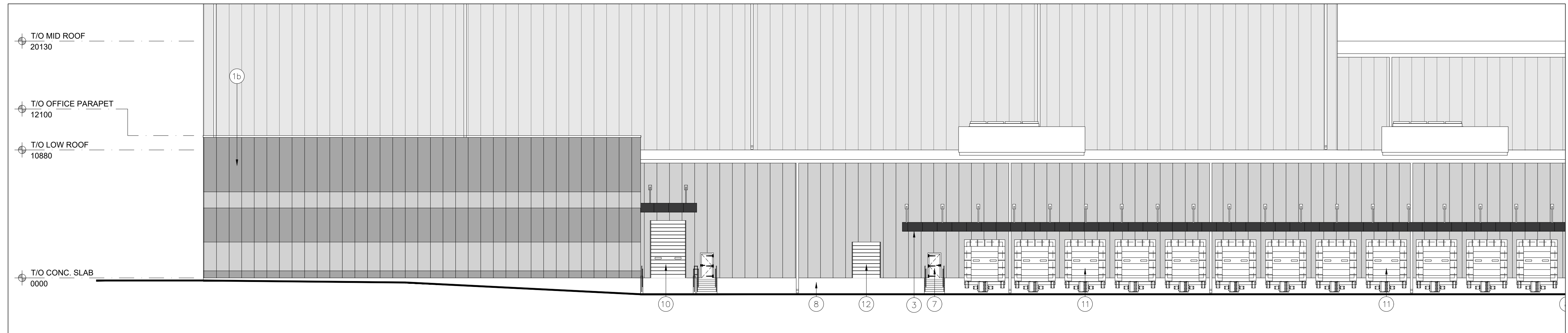
2 SOUTH ELEVATION (PARTIAL) A-3.1 1:200