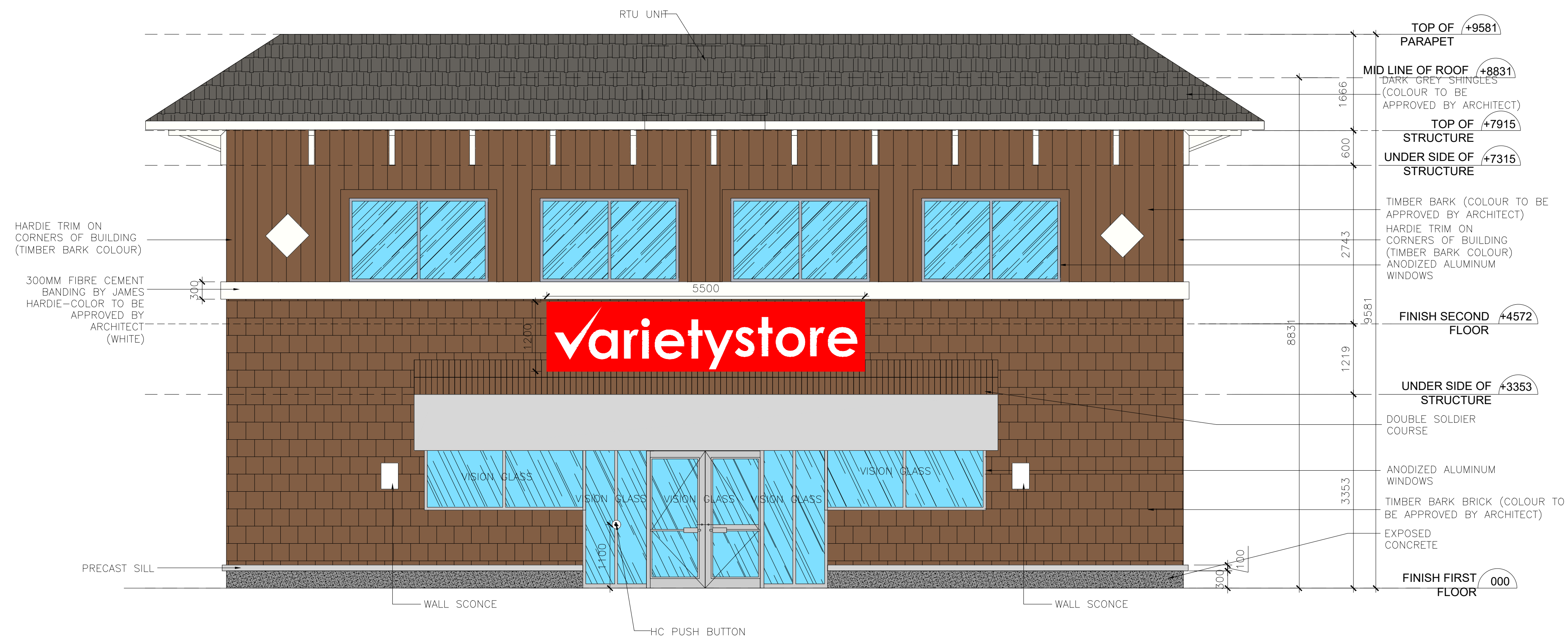
1 EAST ELEVATION Aa-3.0a SCALE:1:50