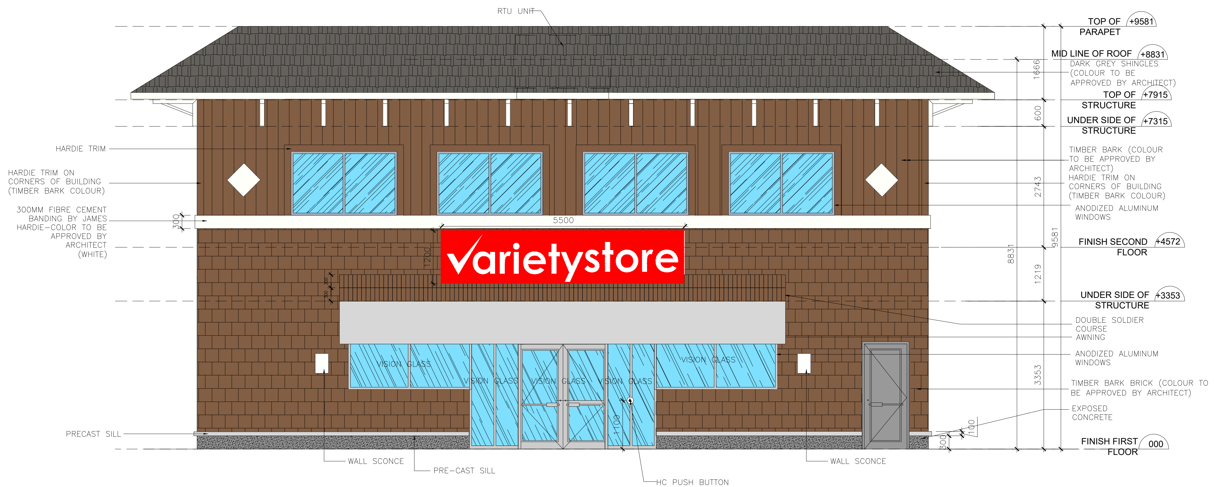
2 WEST ELEVATION Aa-3.0a SCALE:1:50