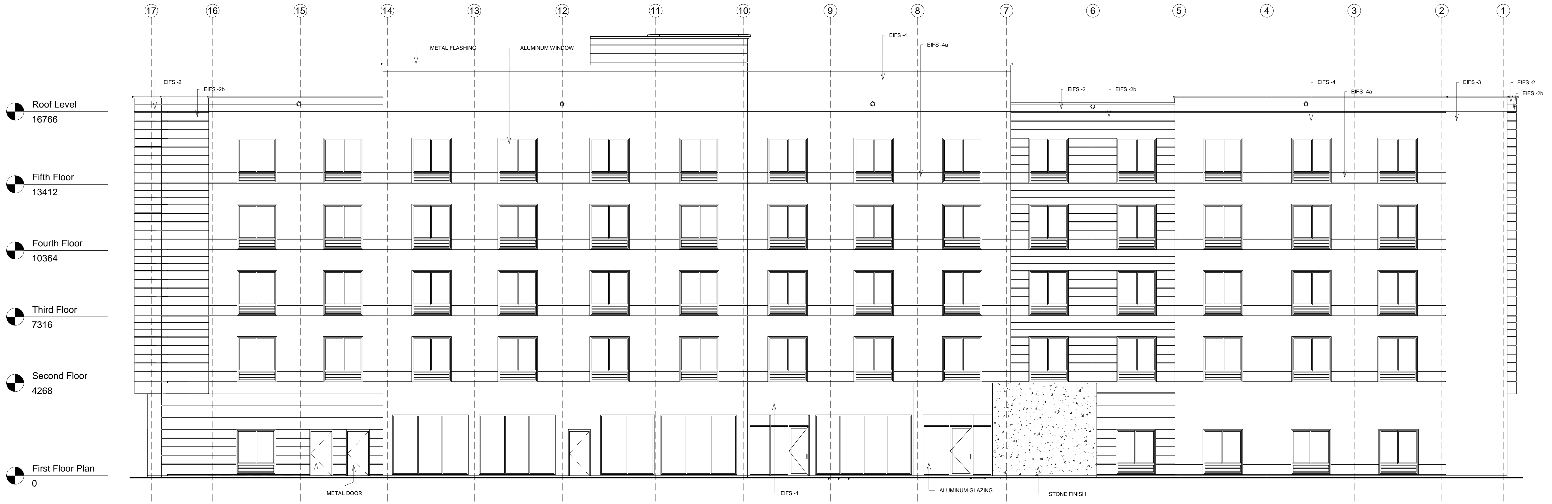
2 East Elevation 1 : 100

ALL INFORMATION AND DIMENSIONS MUST BE CHECKED AND VERIFIED ON SITE. DO NOT SCALE DRAWINGS. ANY VARIANCES OR DISCREPANCIES MUST BE REPORTED TO THE DESIGNER PRIOR TO COMMENCEMENT OF THE WORK. ALL WORK SHALL BE CARRIED OUT IN ACCORDANCE WITH ALL BY-LAWS AND BUILDING CODES HAVING JURISDICTION OVER THIS CONSTRUCTION SITE. THE DESIGN AND CONTRACT DRAWINGS ARE THE COPYRIGHT OF THE DESIGNER AND MAY NOT BE REPRODUCED, REUSED OR ALTERED WITHOUT THE WRITTEN PERMISSION OF THE DESIGNER.