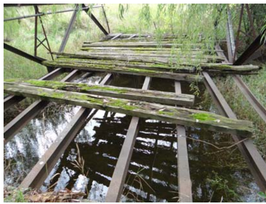
P3 - An old on-site bridge crossing Salt Creek