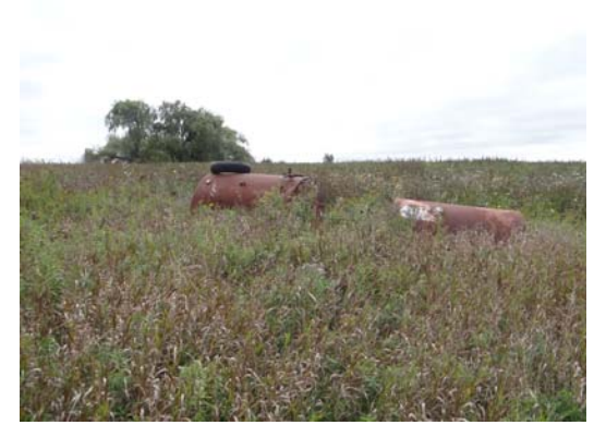
P6 - Two ASTs located at 12484 Airpot Road, adjacent property to the east of Site