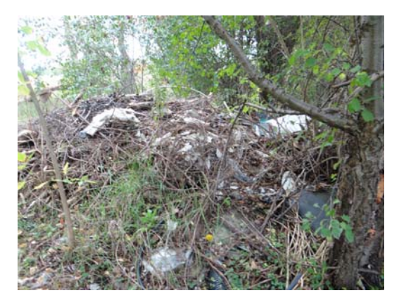
P4 - A debris pile located on the Site at a close distance from the on-site bridge