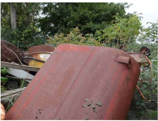
P2 - A debris pile located on the site containing scrap metal including an empty AST