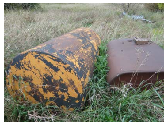
P5 - Two ASTs located on-site and approximately 60 m in a southeast direction from Salt Creek