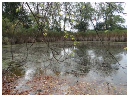
P1 - Circular lagoon located approximately 40 m from the farmhouse