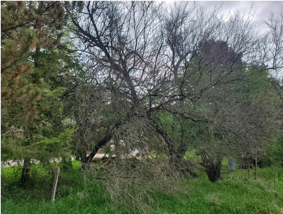
Figure 9: Trees 21-24