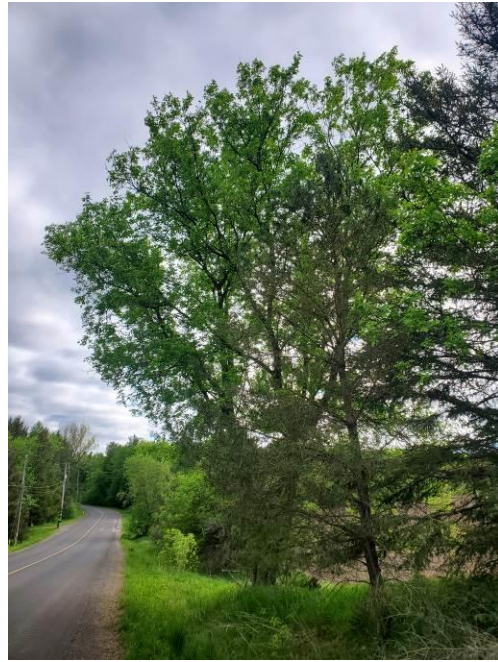
Figure 4: Trees 2 and 3.