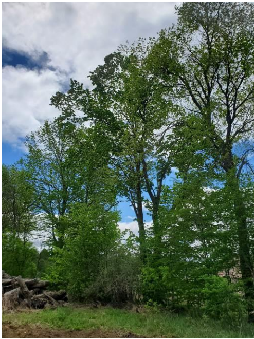
Figure 15: Tree 74