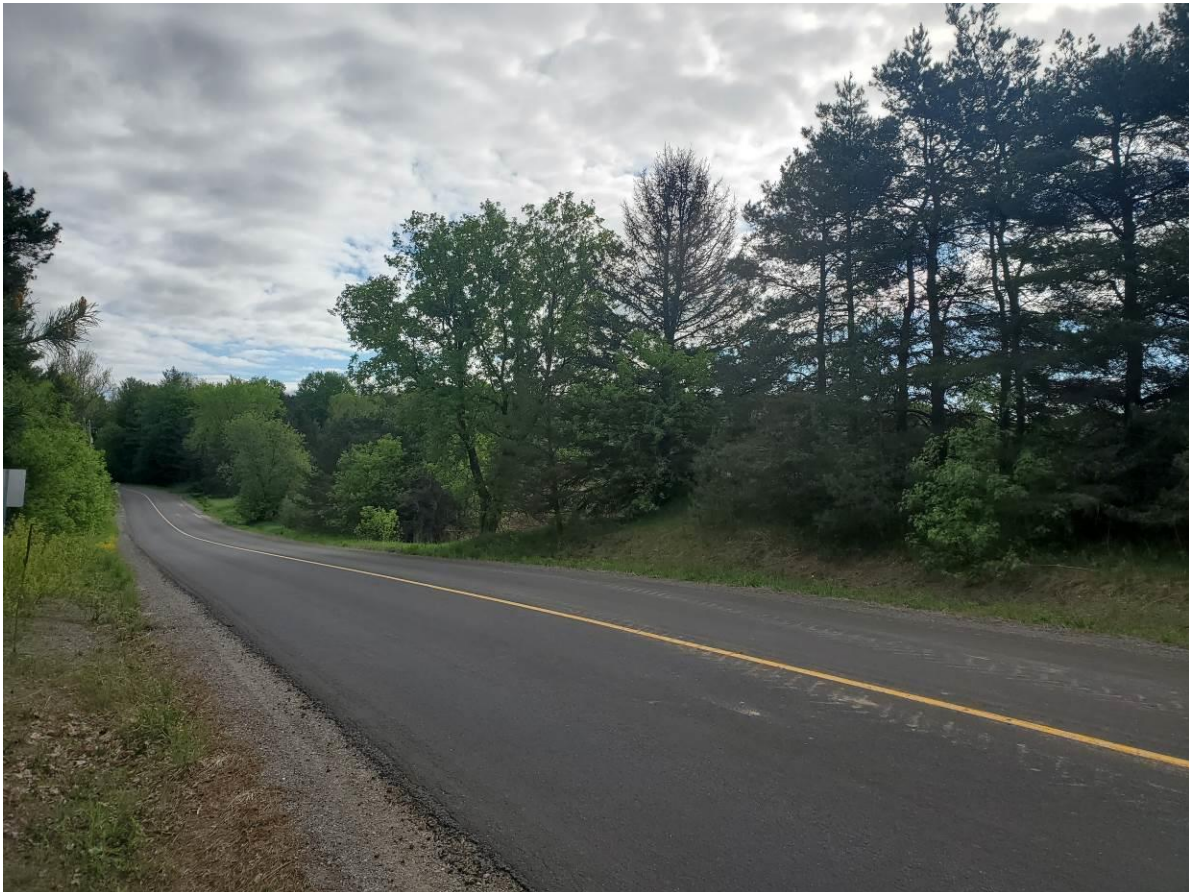
Figure 2: View of right of way looking east from other side of road on west end.

The portion of the property subject to this development application is the area currently occupied by agricultural uses. The proposal calls for large estate residential lots. Care has been taken to set all lots back from the naturalization areas to minimize conflicts between naturalized areas and developed residential areas.