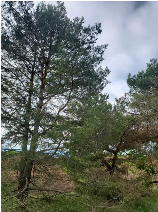
Figure 5: Tree 8.