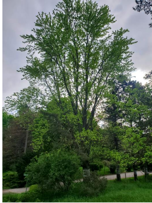
Figure 8: Trees 16 in foreground