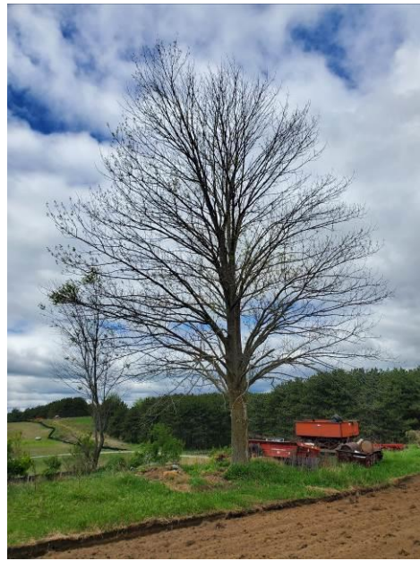
Figure 16: Tree 59