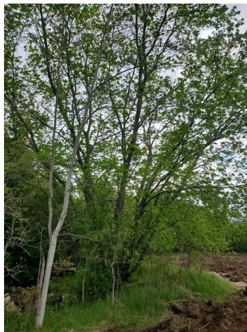
Figure 12: Trees 42 - 49.