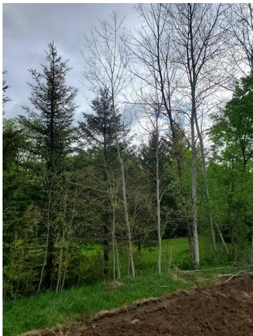
Figure 11: Trees around tree 37