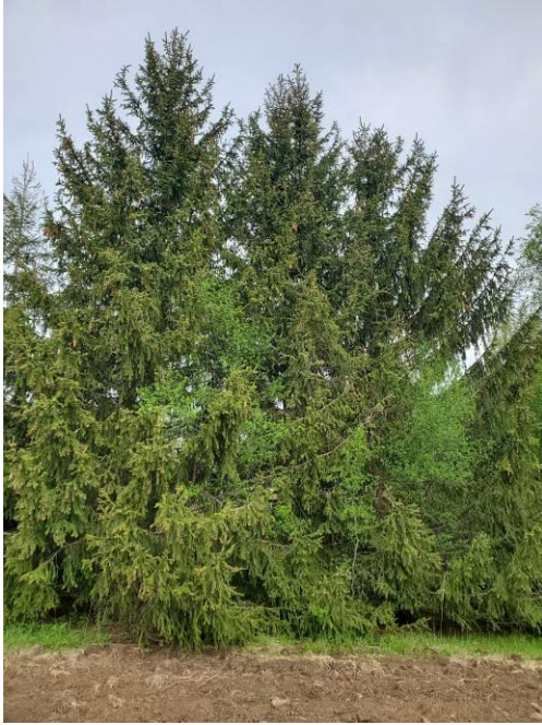
Figure 13: Trees 65 to 73