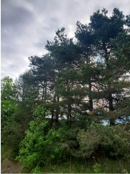
Figure 3: Trees of group 1.

A selection of images have been included to describe the conditions of the property and general context of trees on the site.