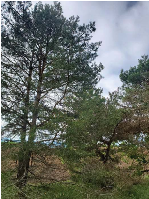
Figure 5: Tree 8.