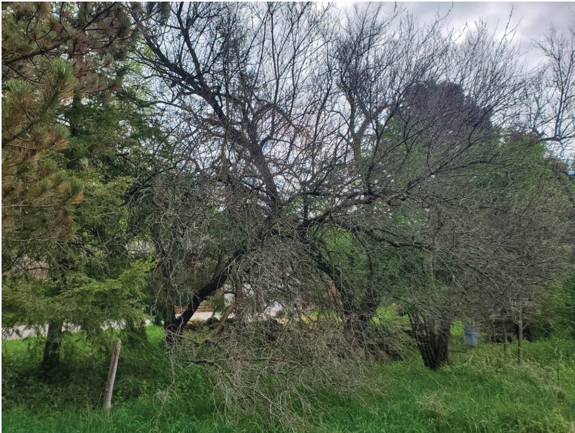
Figure 9: Trees 21-24