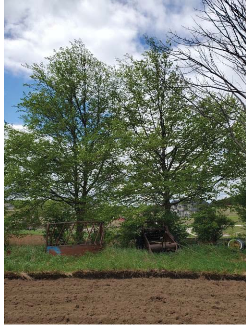
Figure 14: Trees 55 to 56