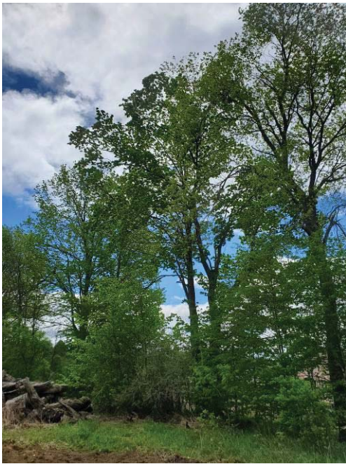
Figure 15: Tree 74