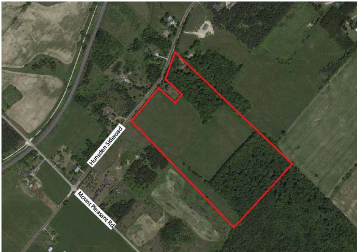
Figure 1. Context Aerial Image

The site was visited in May 2022. It is located at 10249 Hunsden sideroad on the south side and just east of Mount Pleasant Road in Caledon, Ontario. The property is in a rural area with residential uses to the north and east of the property and also naturalized landscapes to the east, south and west of the property. The property has a substantial portion that is under cultivation, however some naturalized woodlots are present on the site that also extend beyond the property boundaries.