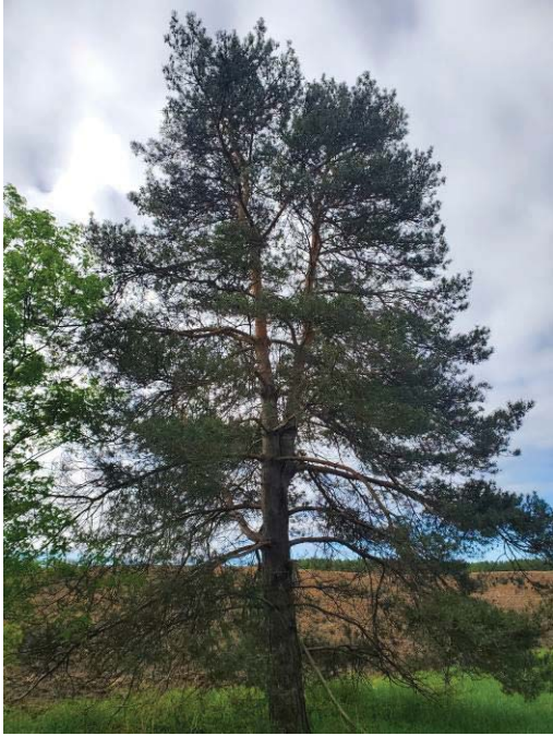
Figure 7: Tree 14