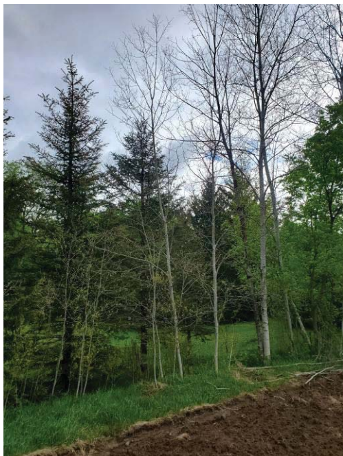
Figure 11: Trees around tree 37