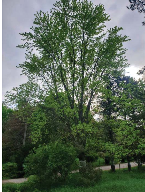
Figure 8: Trees 16 in foreground