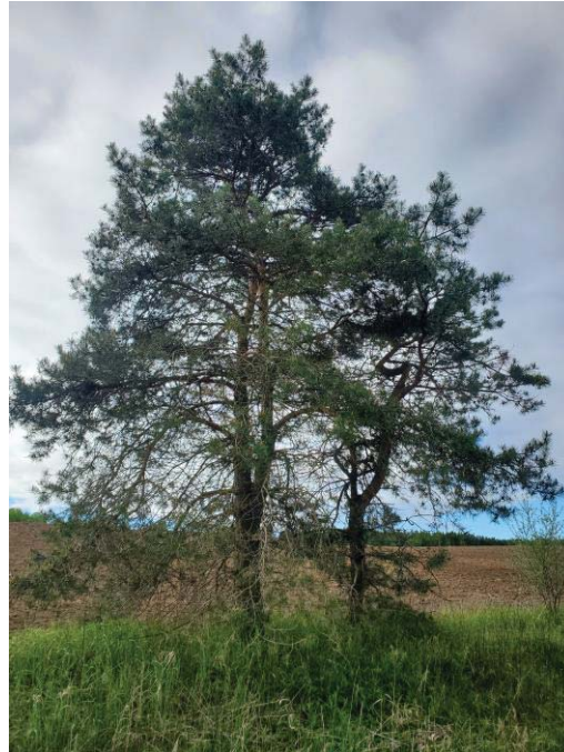
Figure 6: Trees 12 and 13.