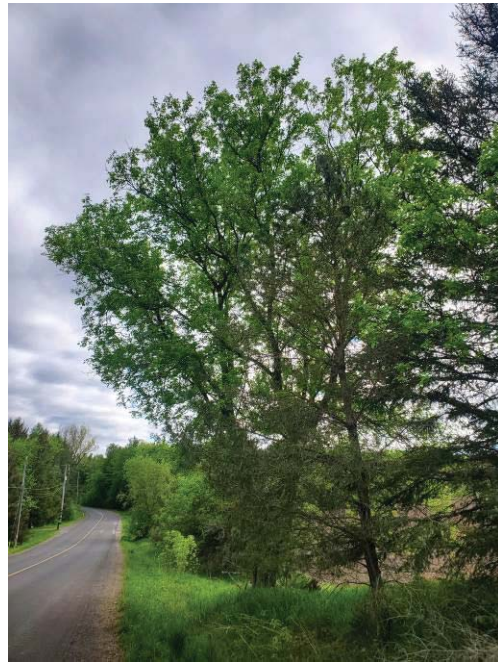
Figure 4: Trees 2 and 3.