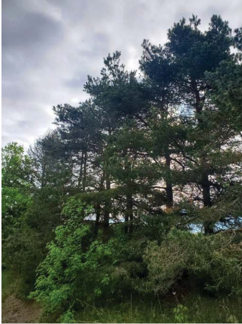
Figure 3: Trees of group 1.

A selection of images have been included to describe the conditions of the property and general context of trees on the site.