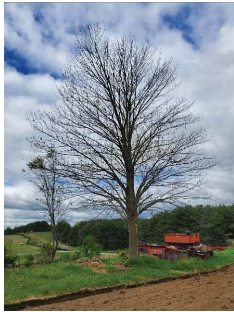
Figure 16: Tree 59