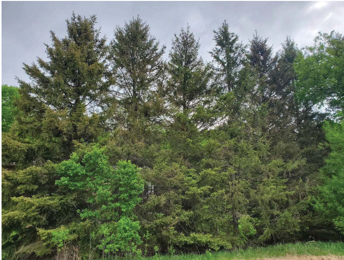
Figure 10: Tree 30