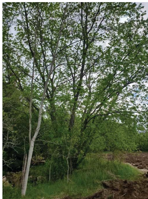
Figure 12: Trees 42 - 49.