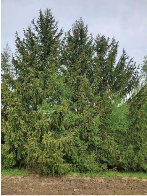
Figure 13: Trees 65 to 73