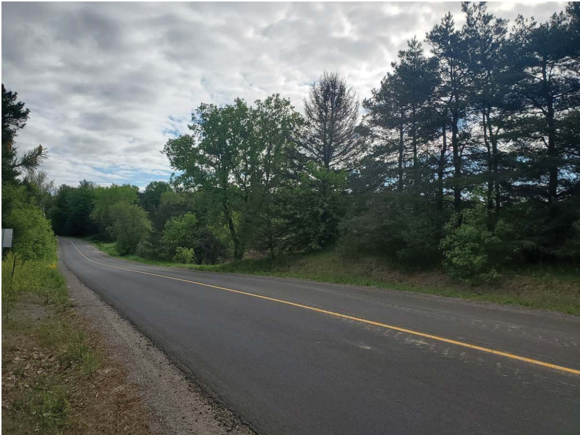
Figure 2: View of right of way looking east from other side of road on west end.

The portion of the property subject to this development application is the area currently occupied by agricultural uses. The proposal calls for large estate residential lots. Care has been taken to set all lots back from the naturalization areas to minimize conflicts between naturalized areas and developed residential areas.