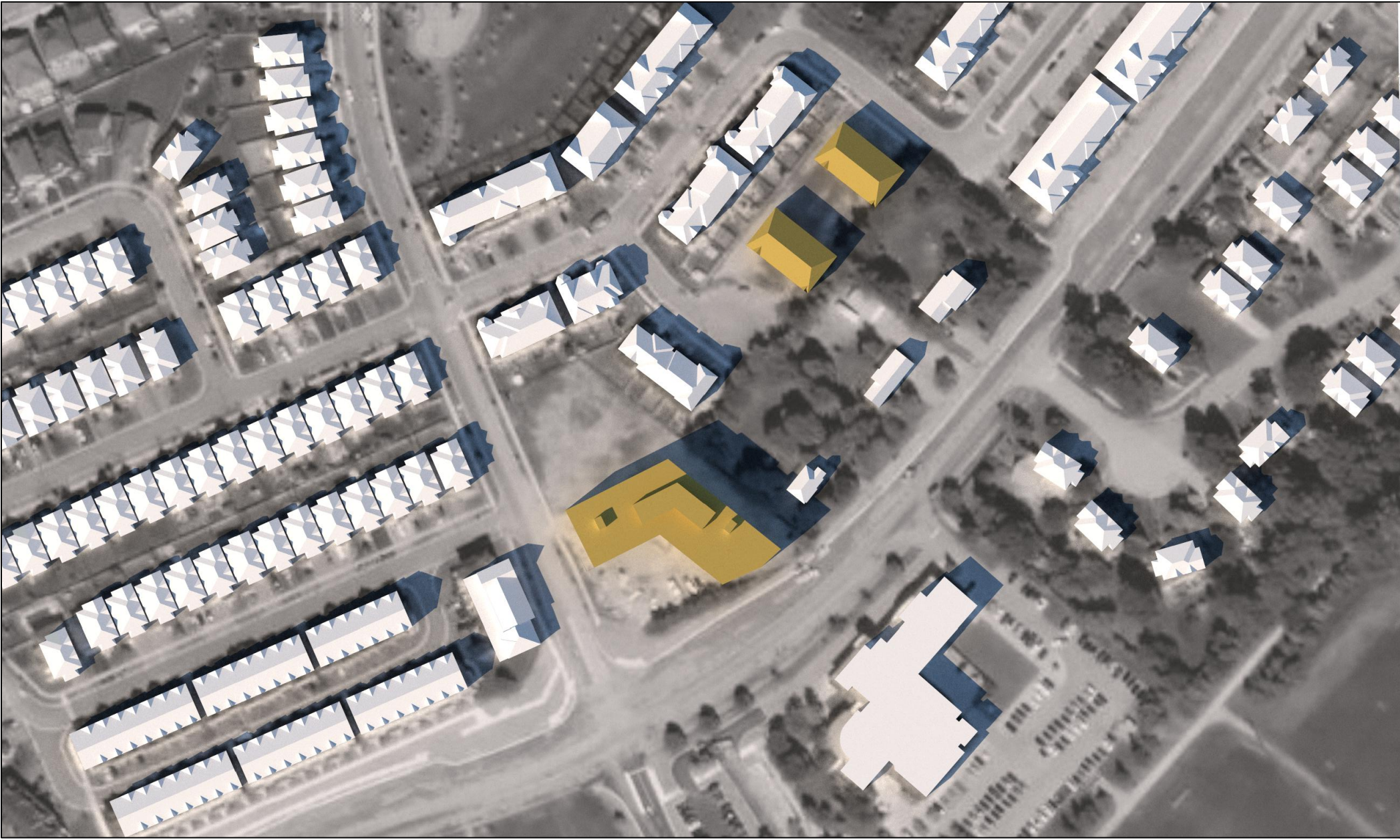
September 21 15:00