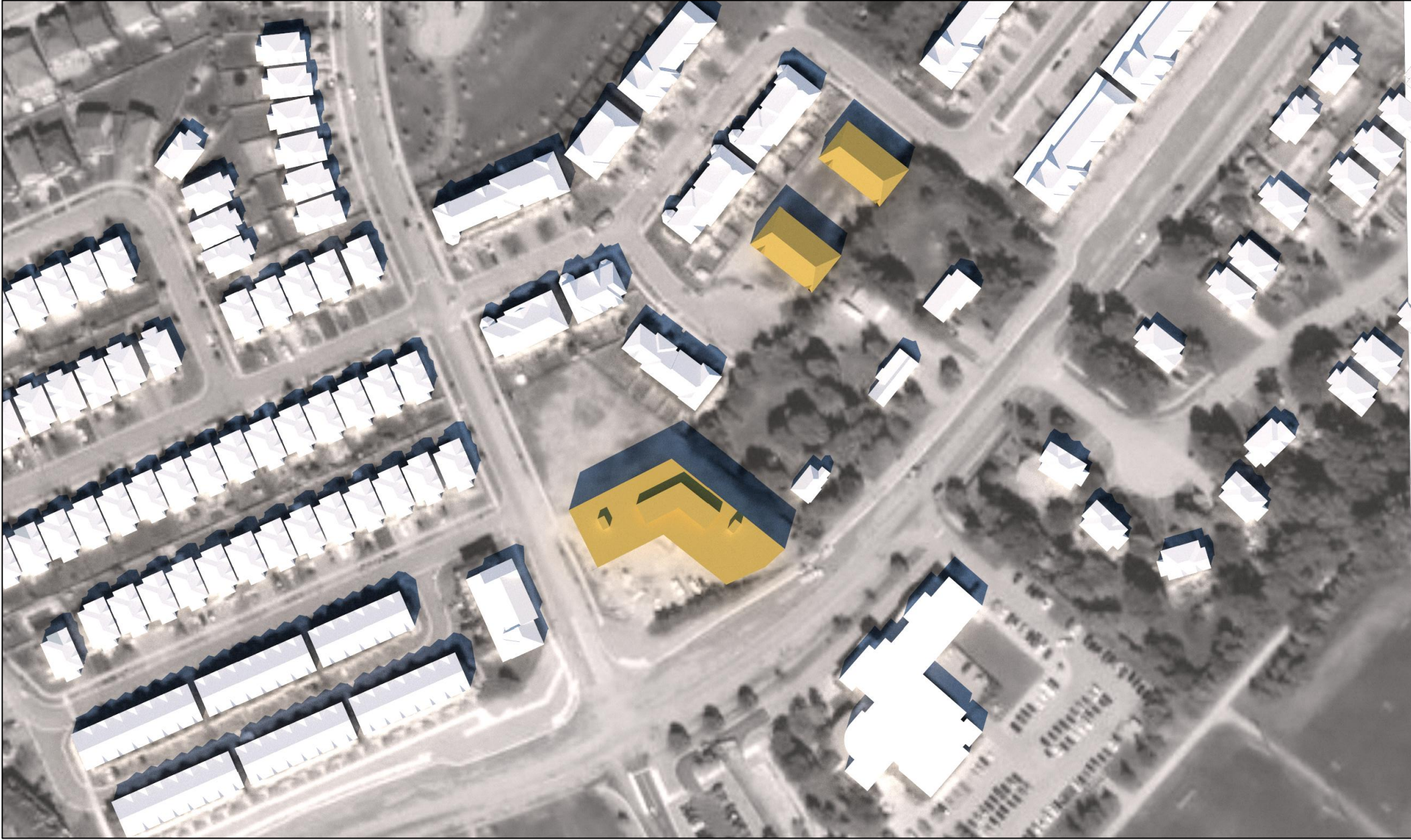
September 21 13:00