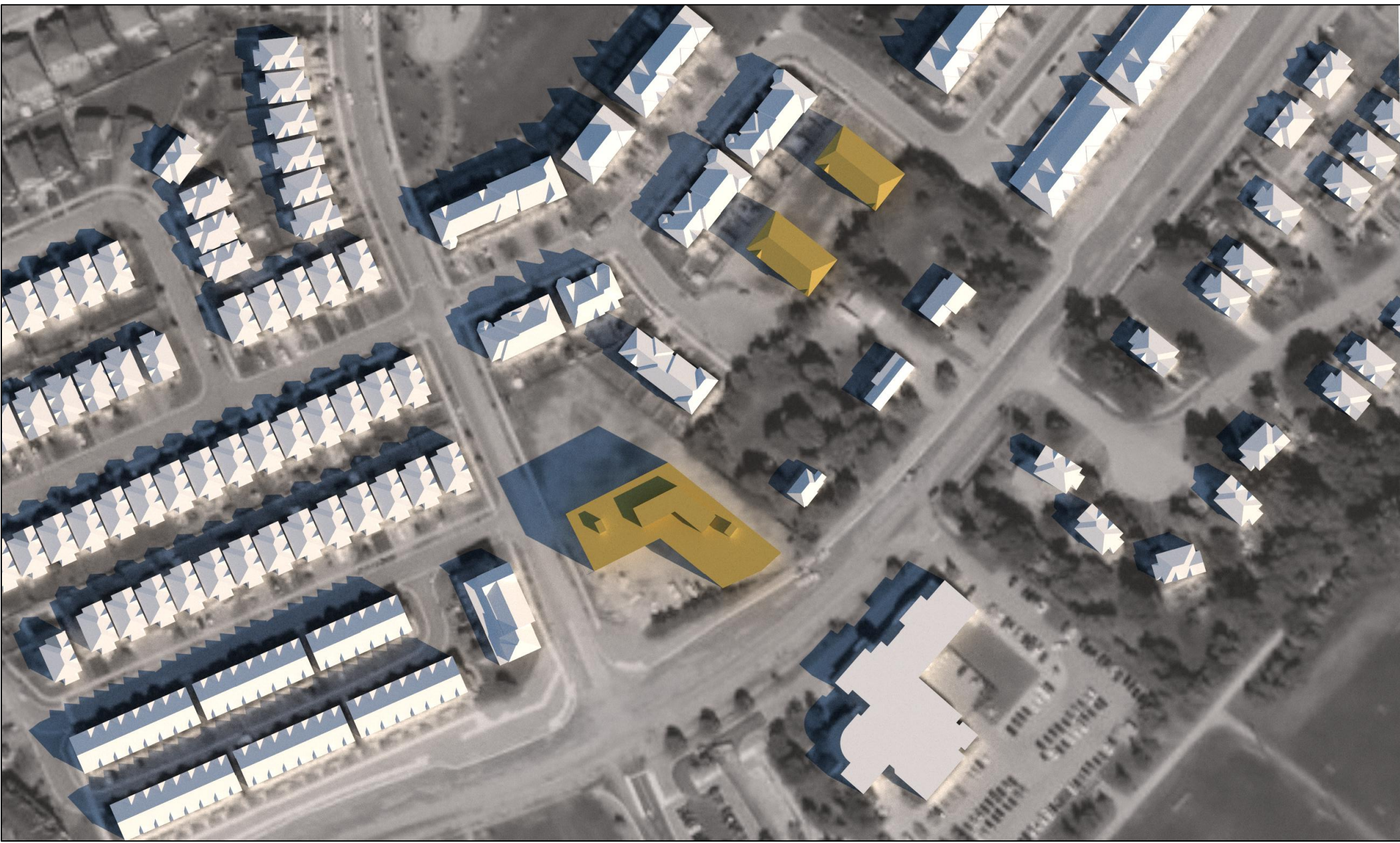
March 21 9:00