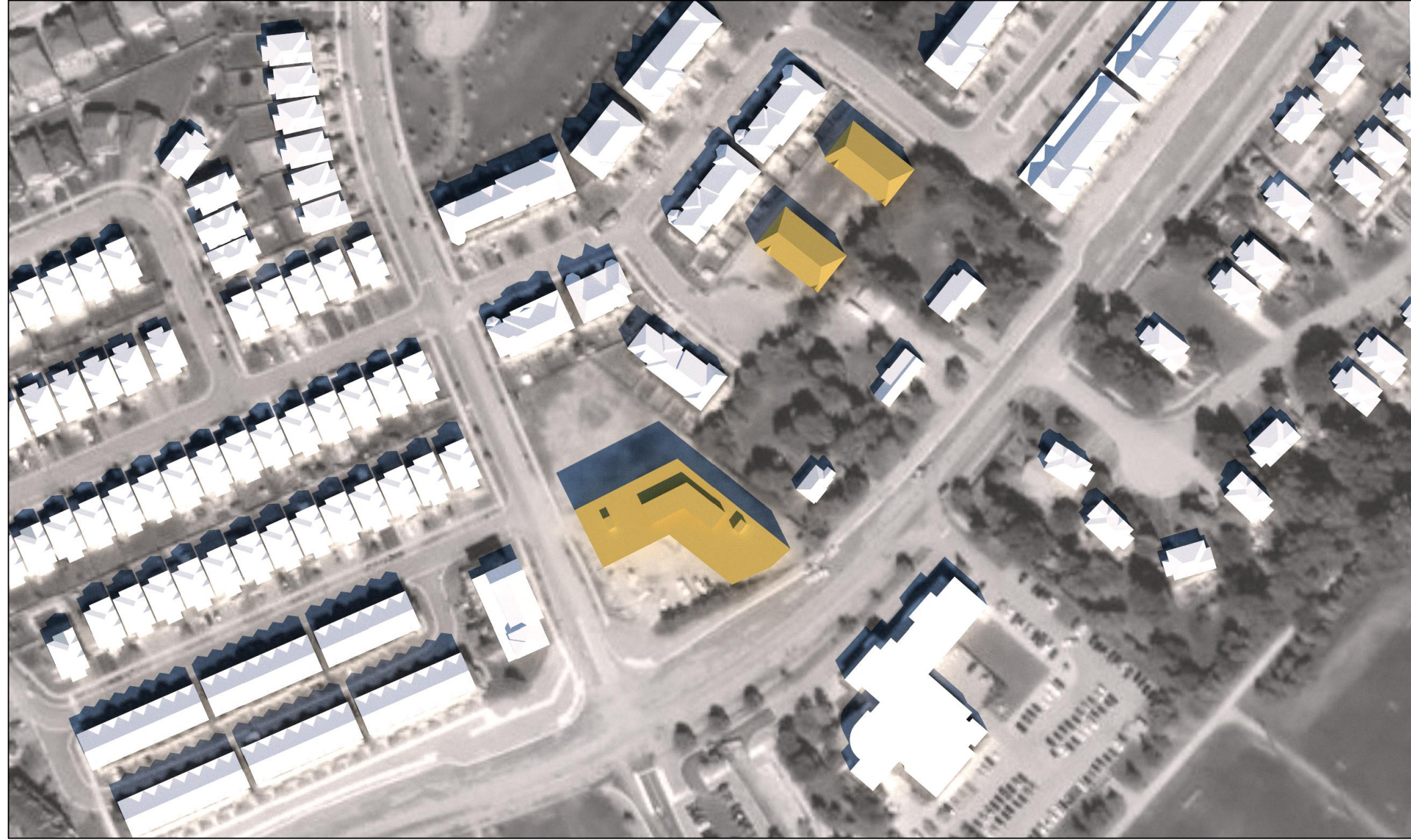
September 21 11:00