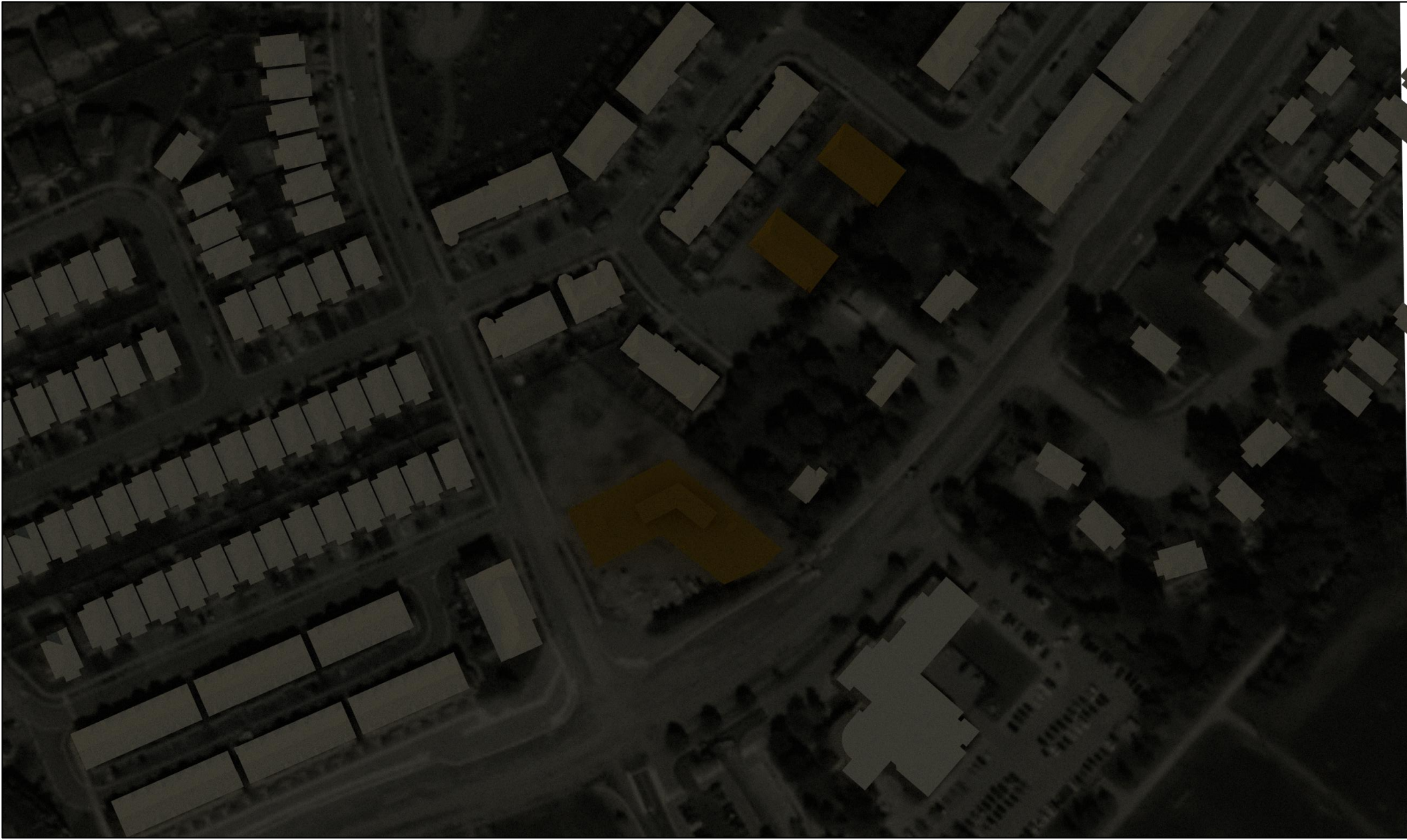
September 21 19:00