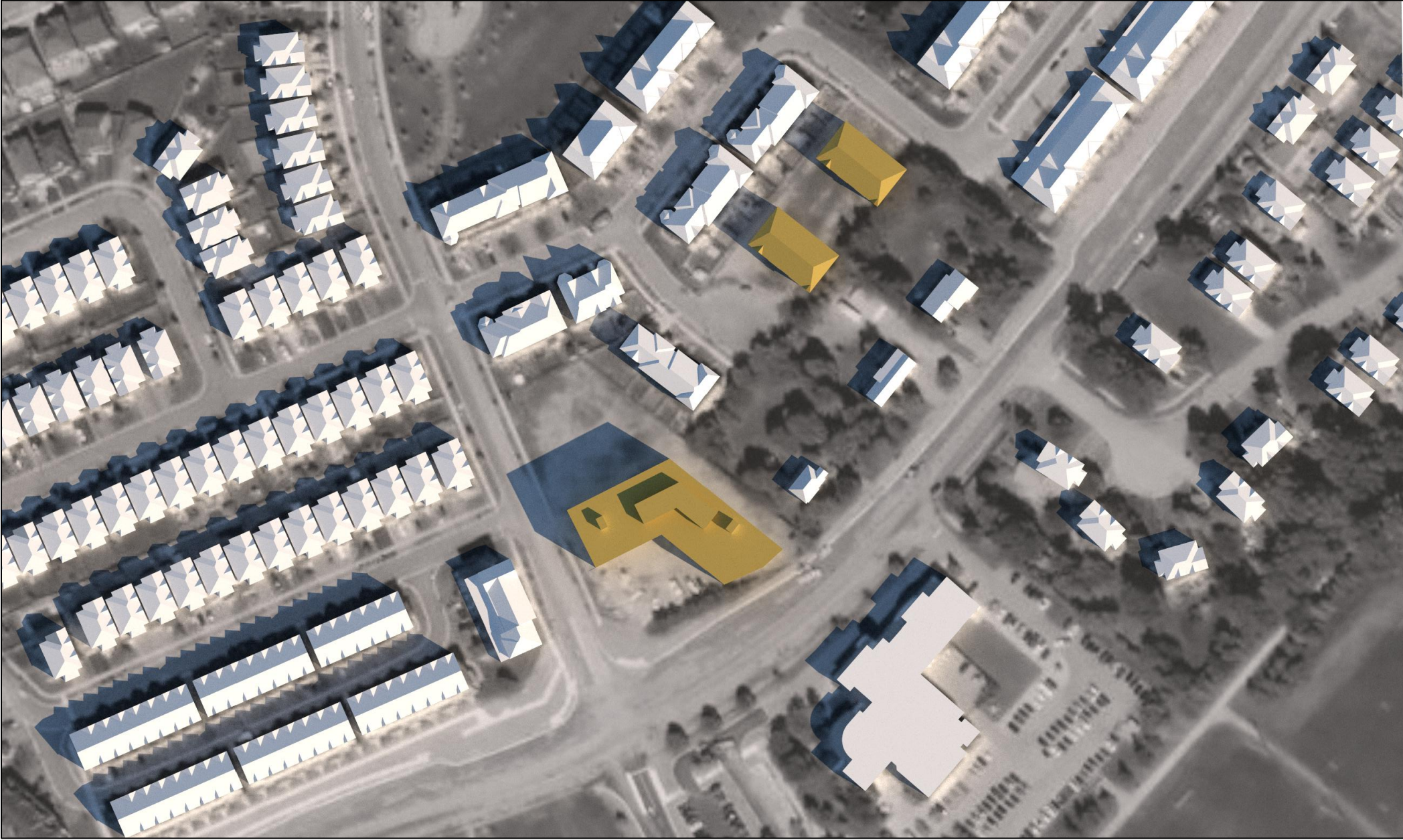
September 21 9:00