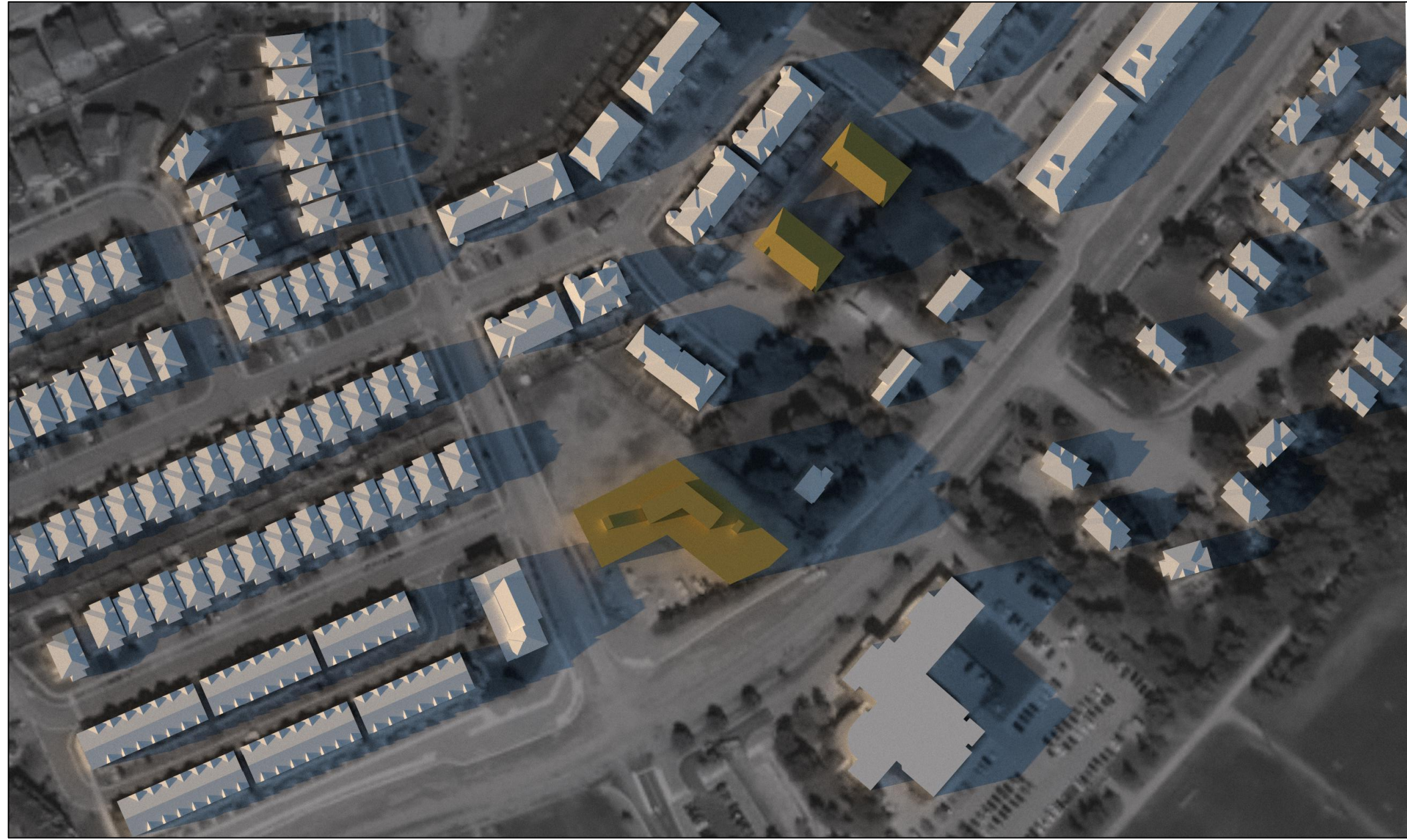
September 21 17:00