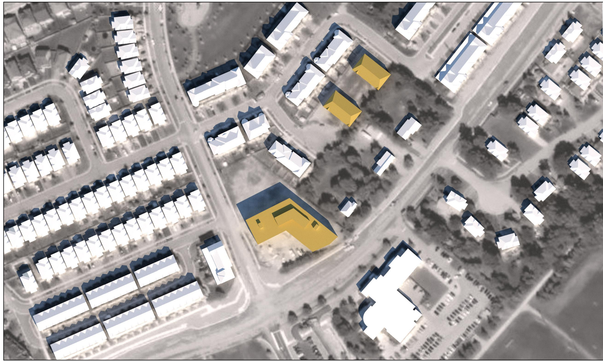
March 21 11:00