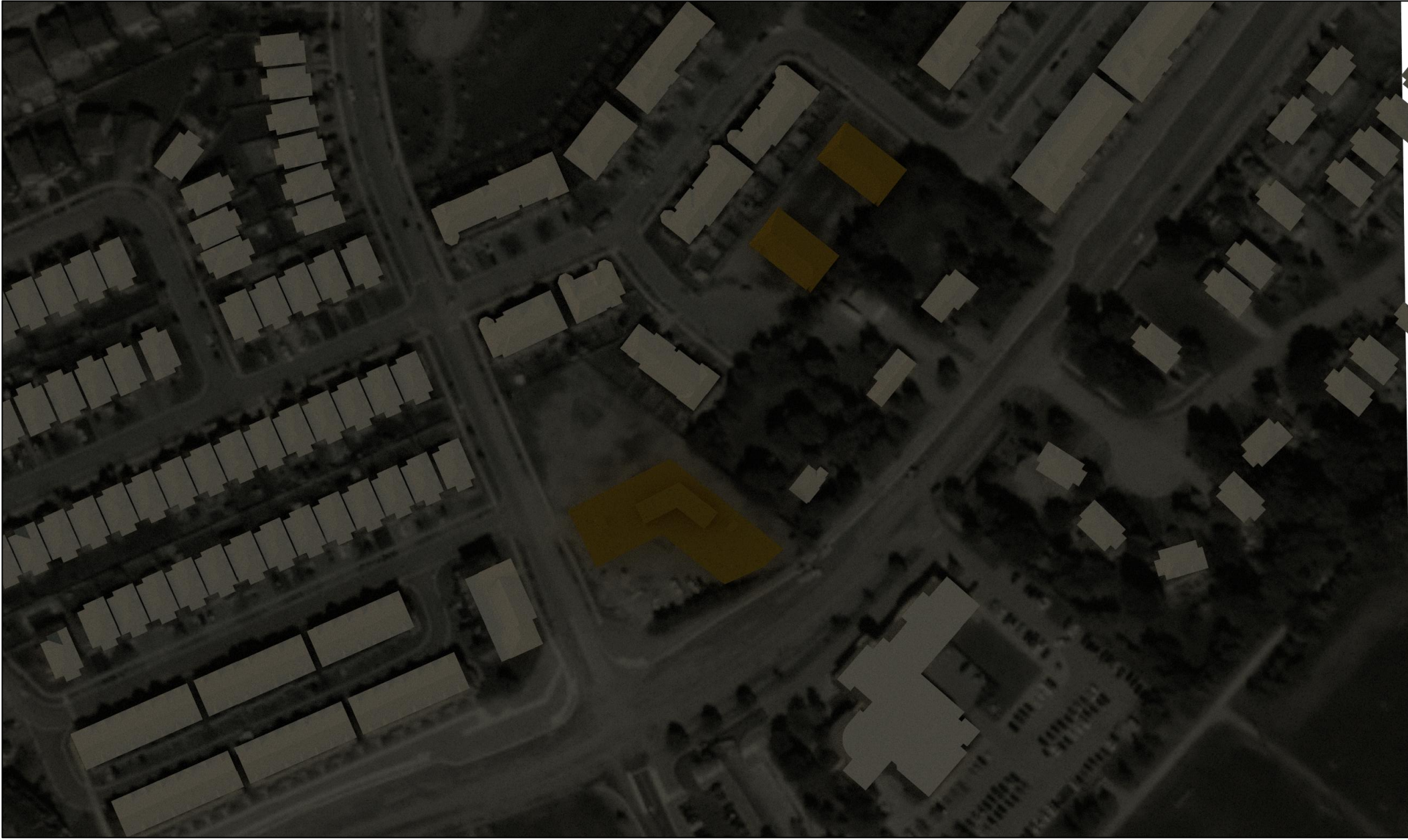
March 21 19:00