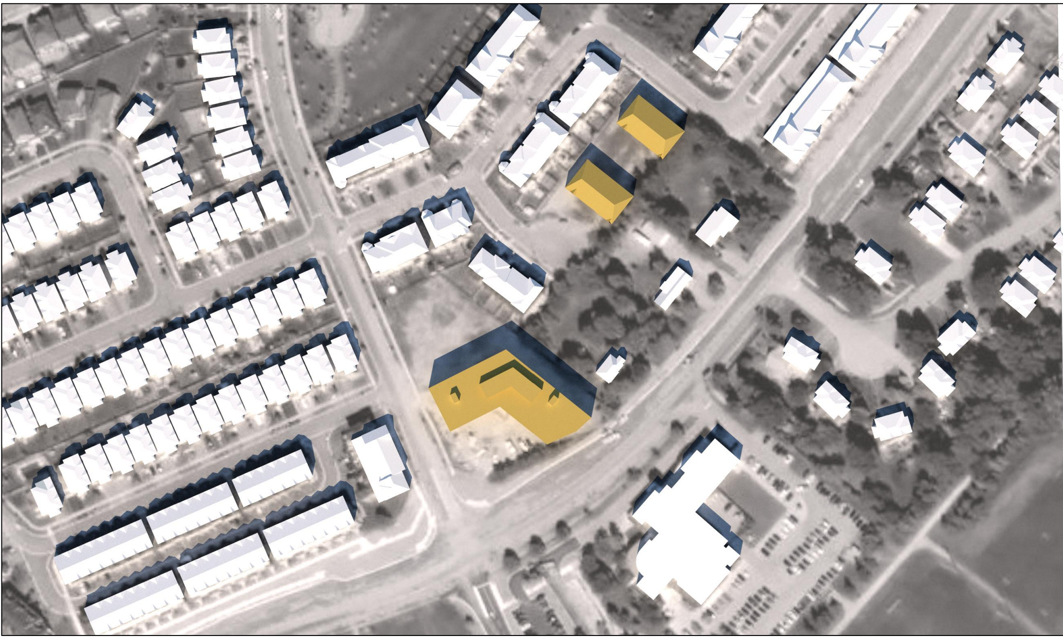
March 21 13:00