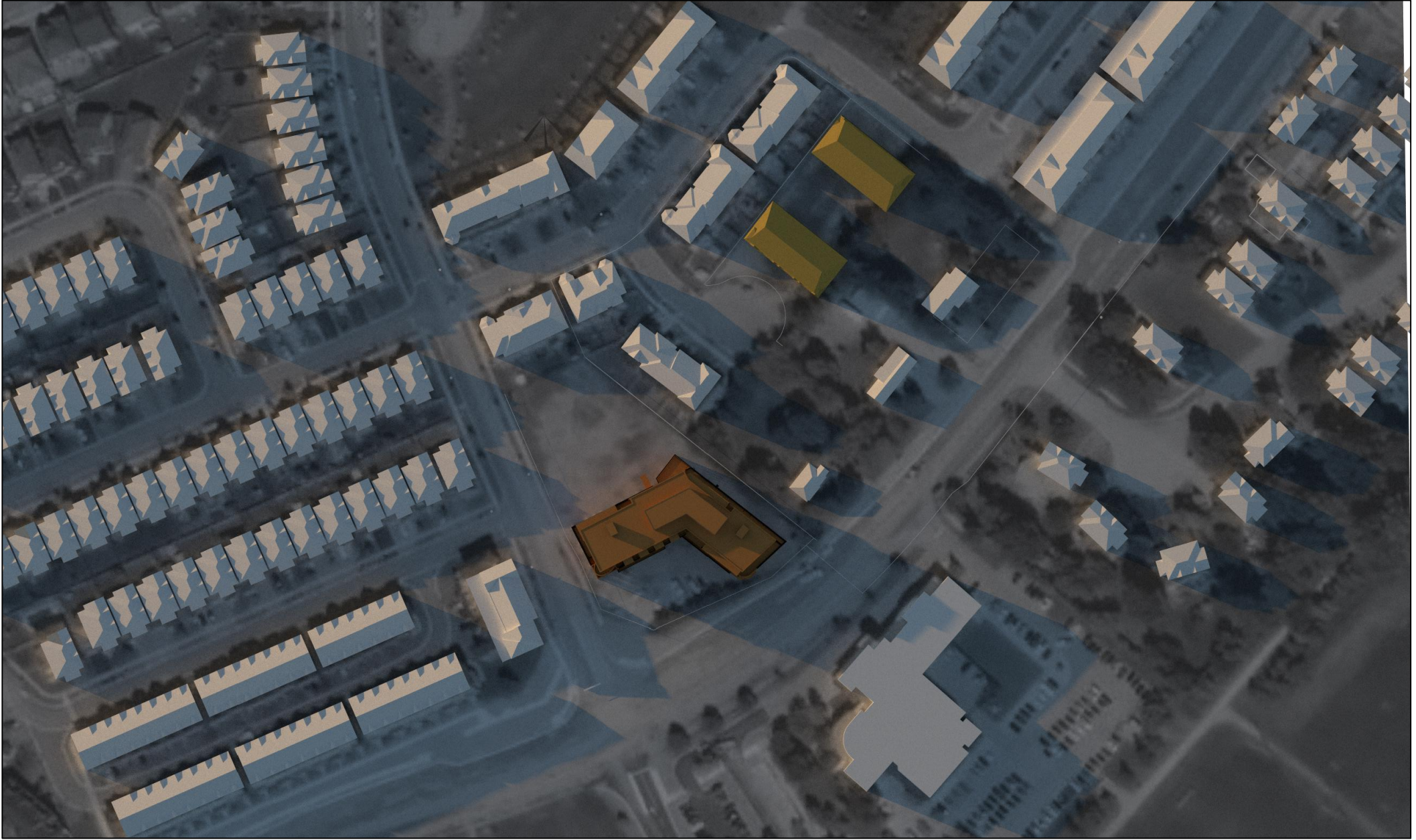
June 21 19:00