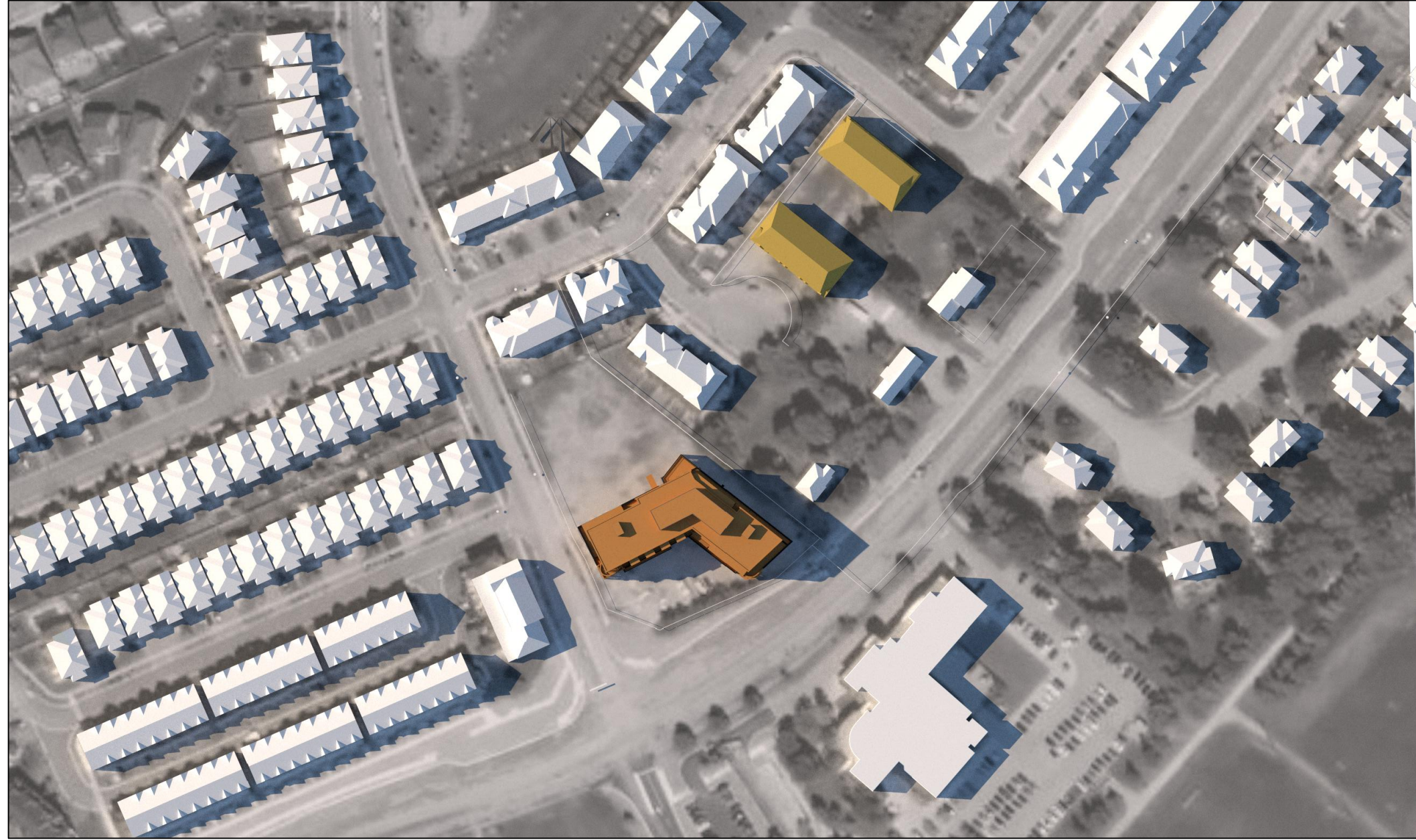
June 21 17:00