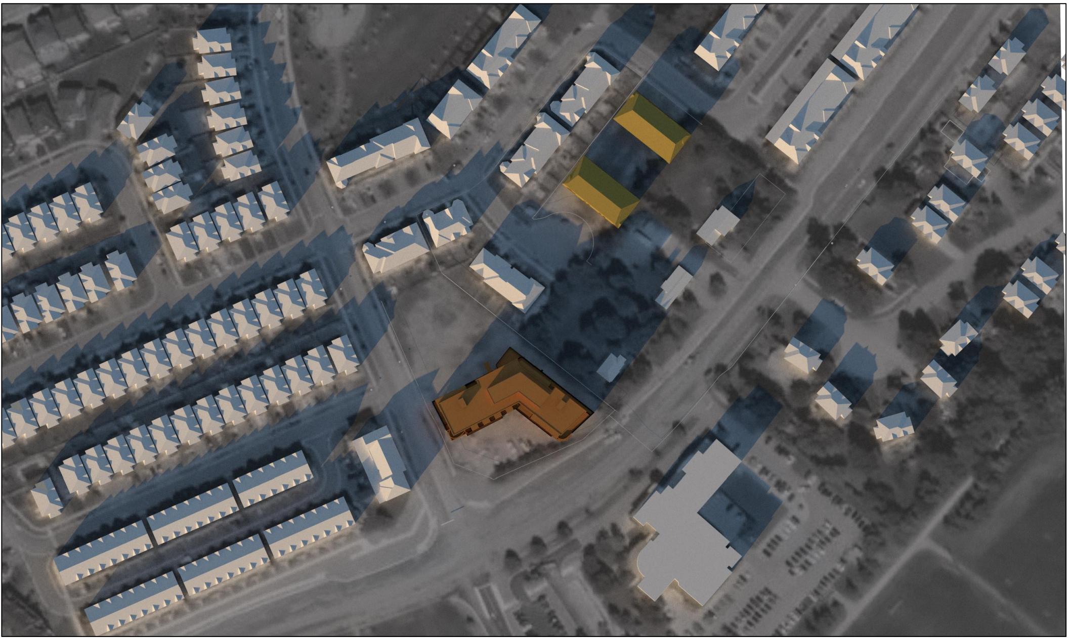
December 21 15:00