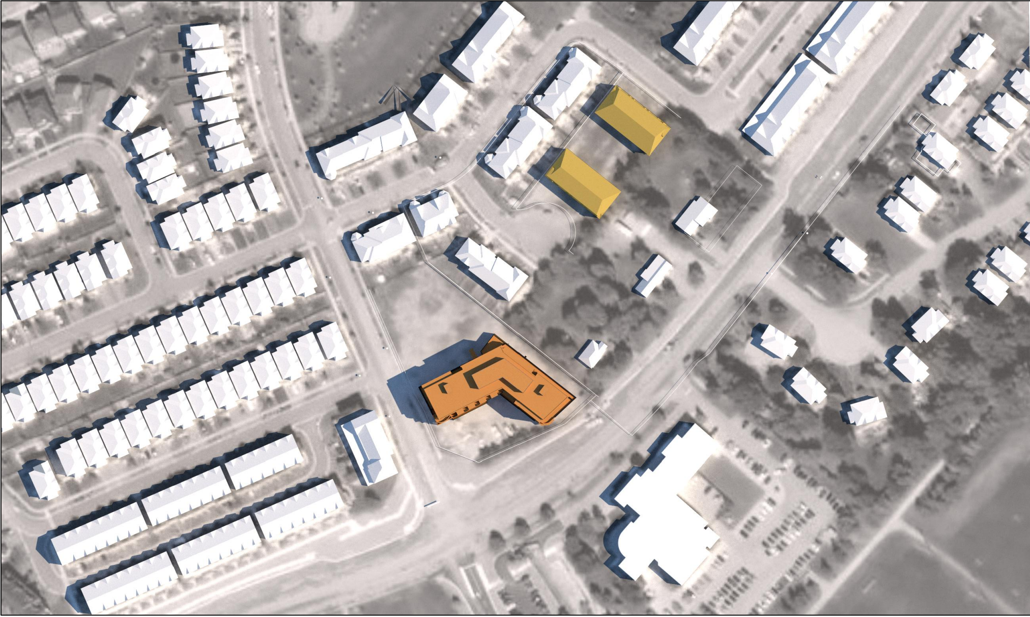
June 21 9:00