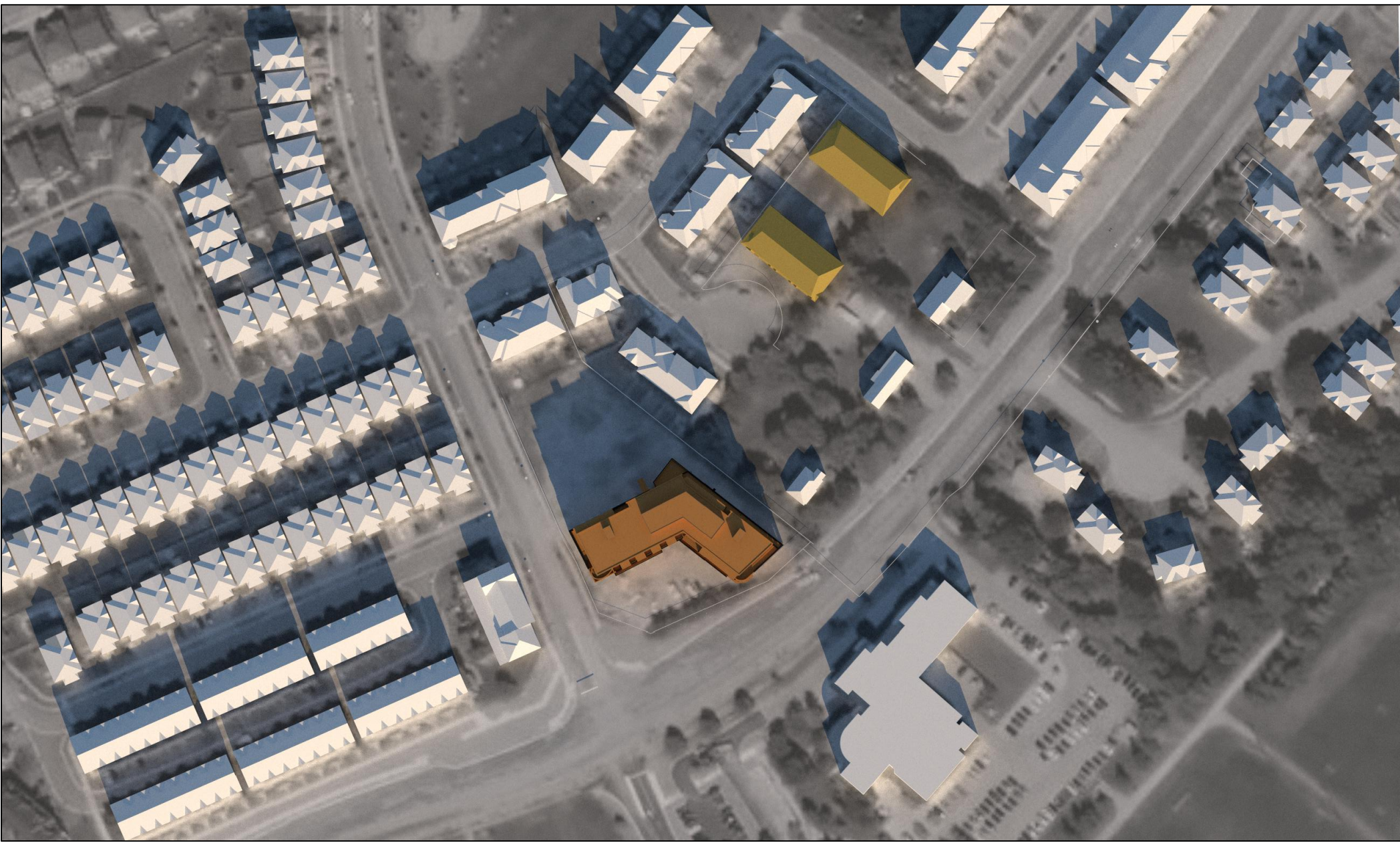
December 21 11:00