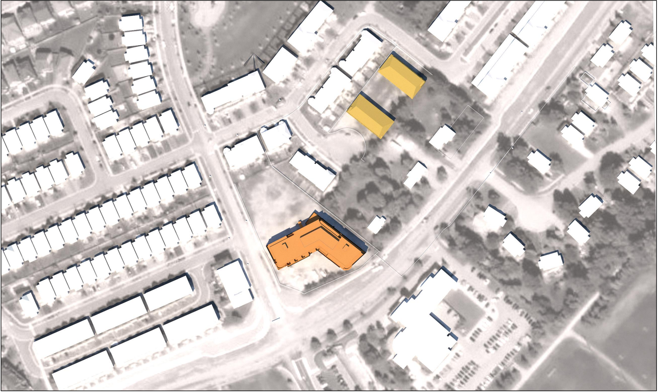
June 21 13:00