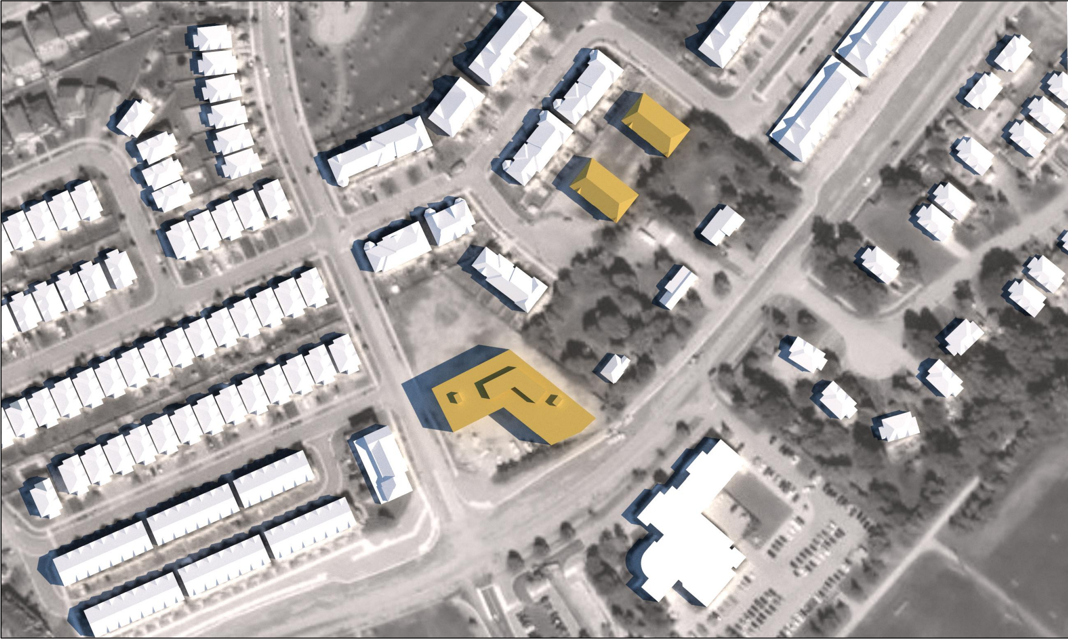
June 21 9:00