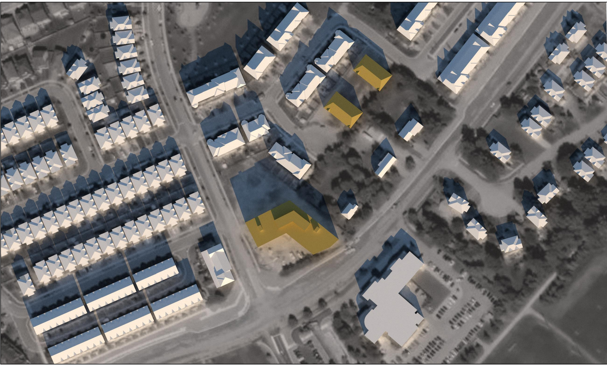
December 21 11:00