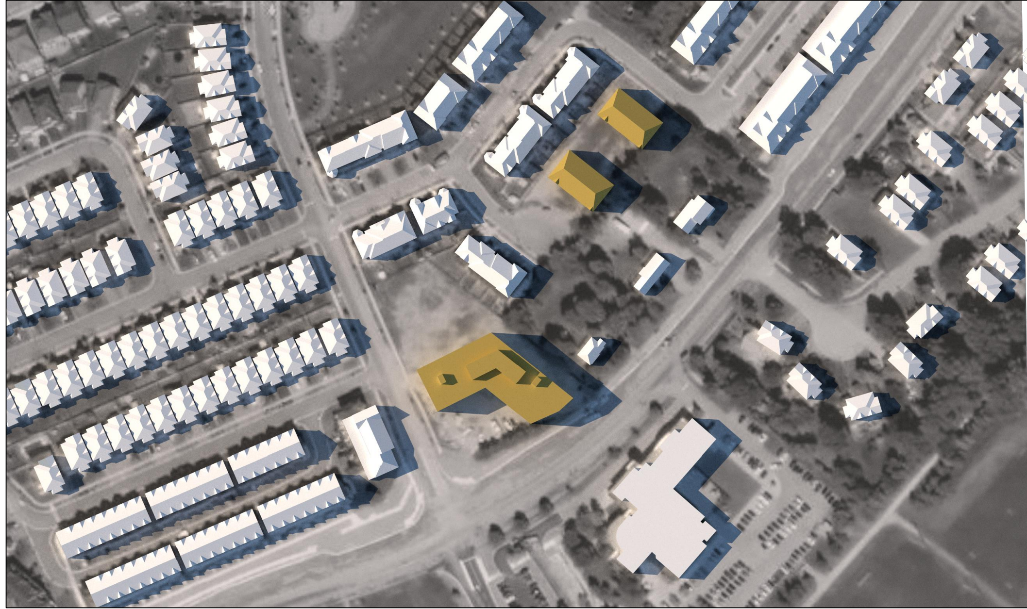
June 21 17:00