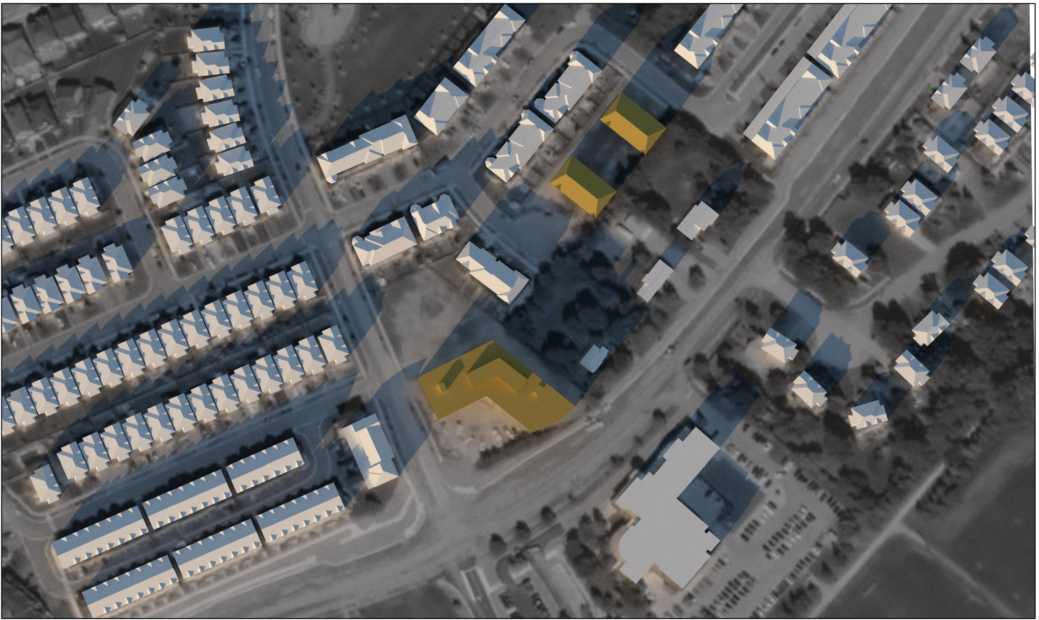
December 21 15:00