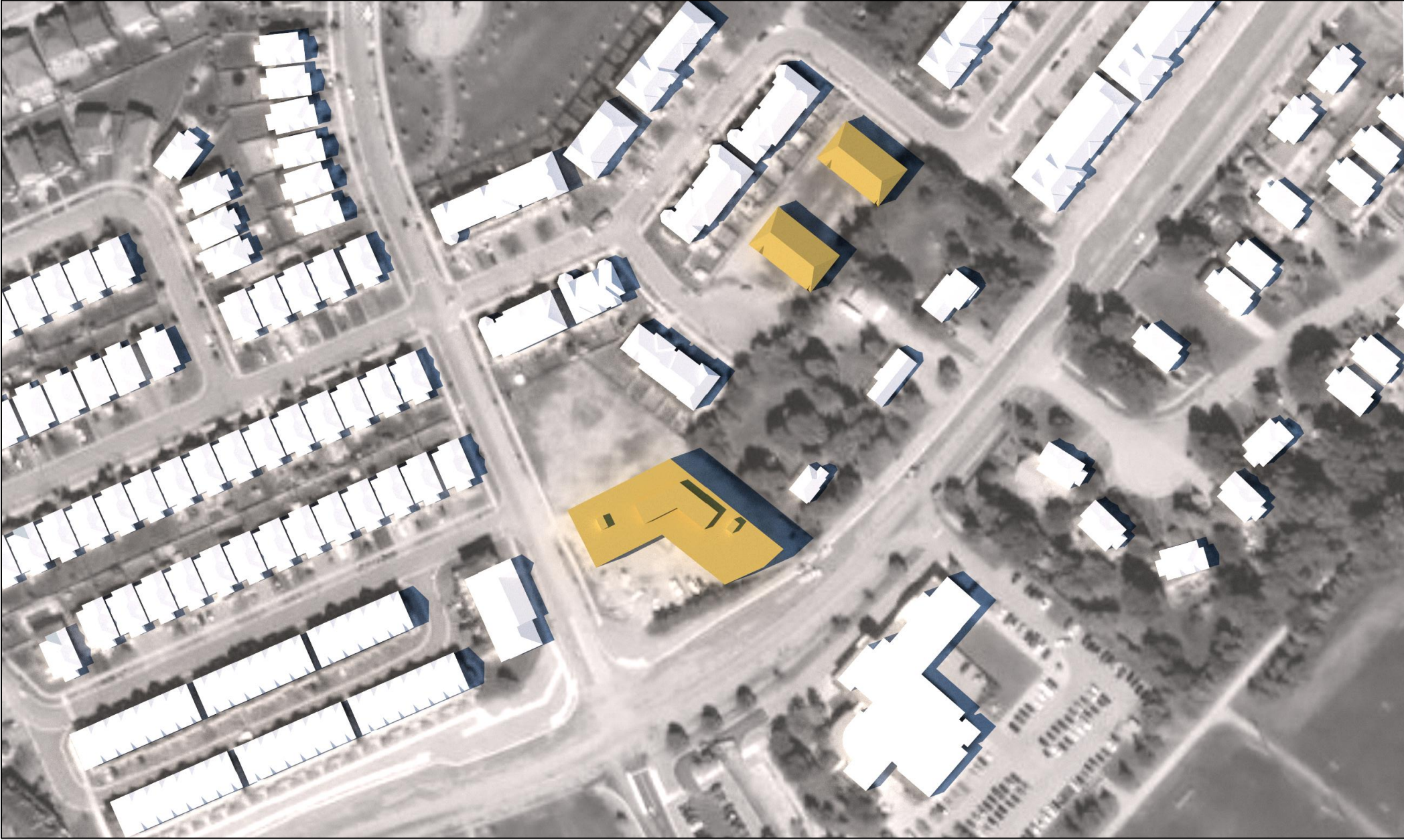
June 21 15:00