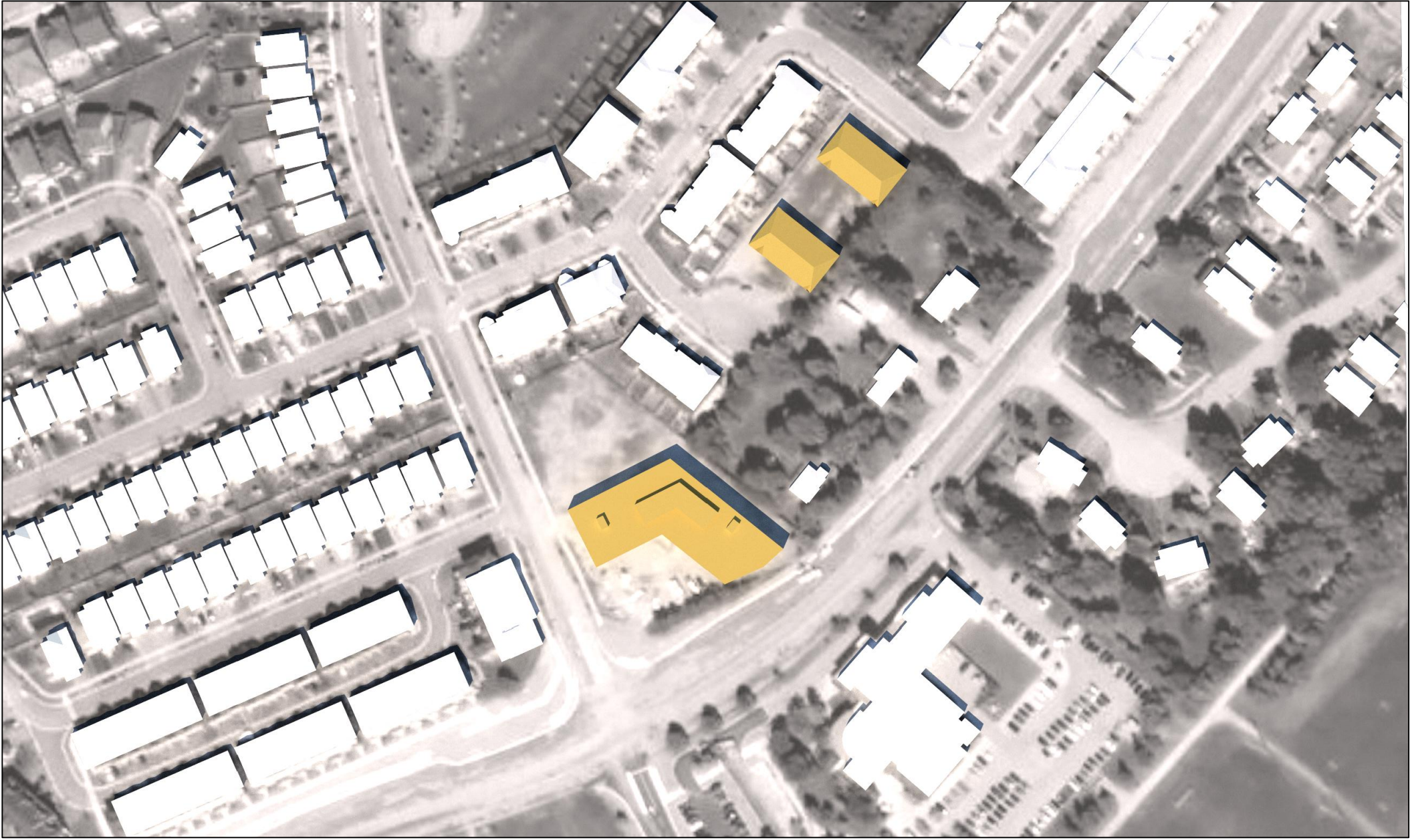
June 21 13:00