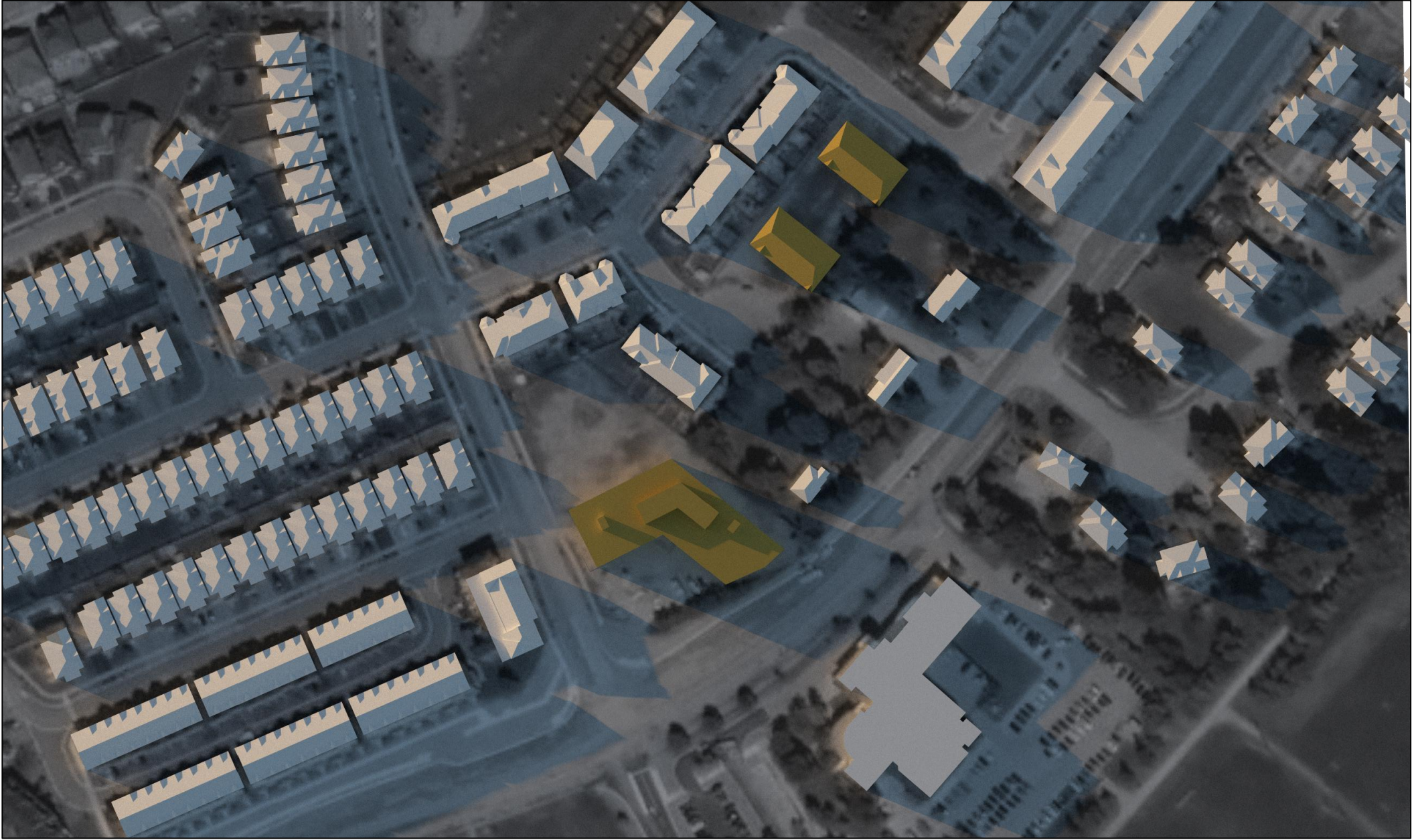
June 21 19:00