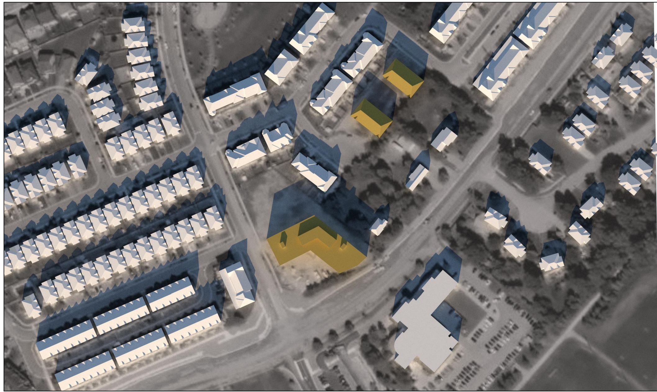
December 21 13:00