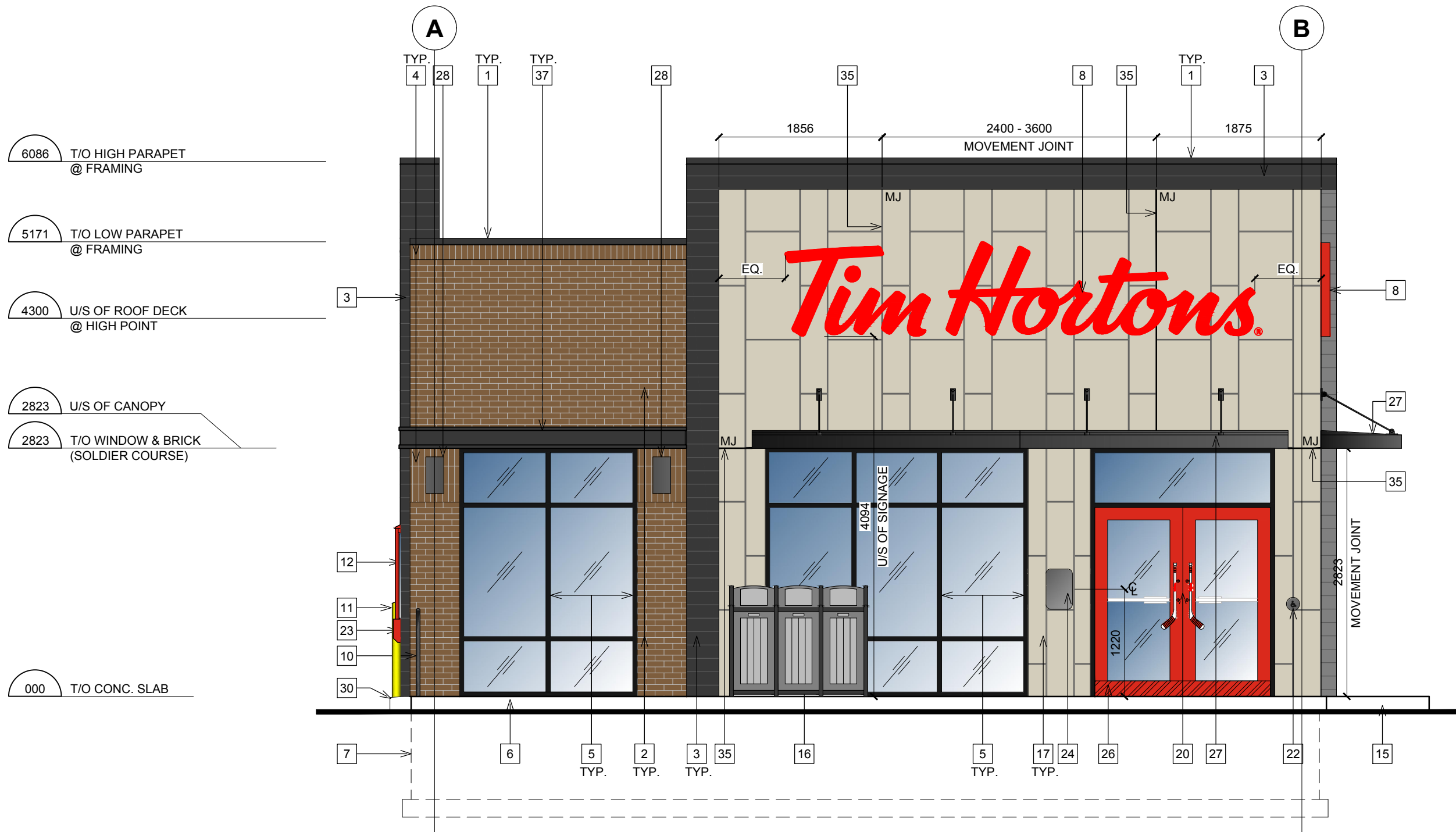
2 EAST ELEVATION A5 SCALE: 1:50