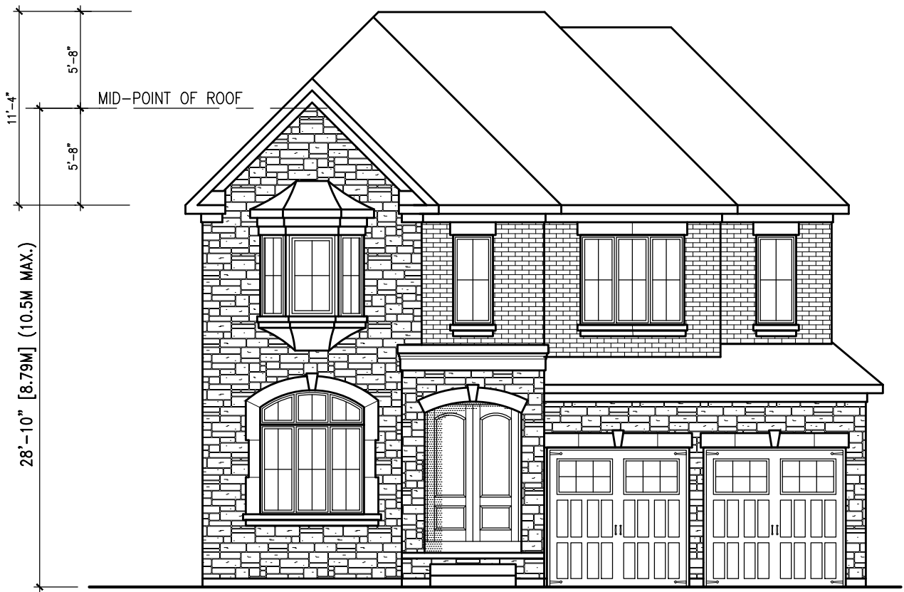
FRONT ELEVATION 'A' 43-6