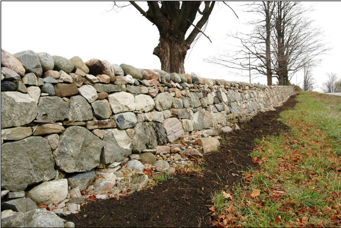
Patullo-McDiarmid Dry Stone Wall: Restored using existing stone and new cedar shakes.