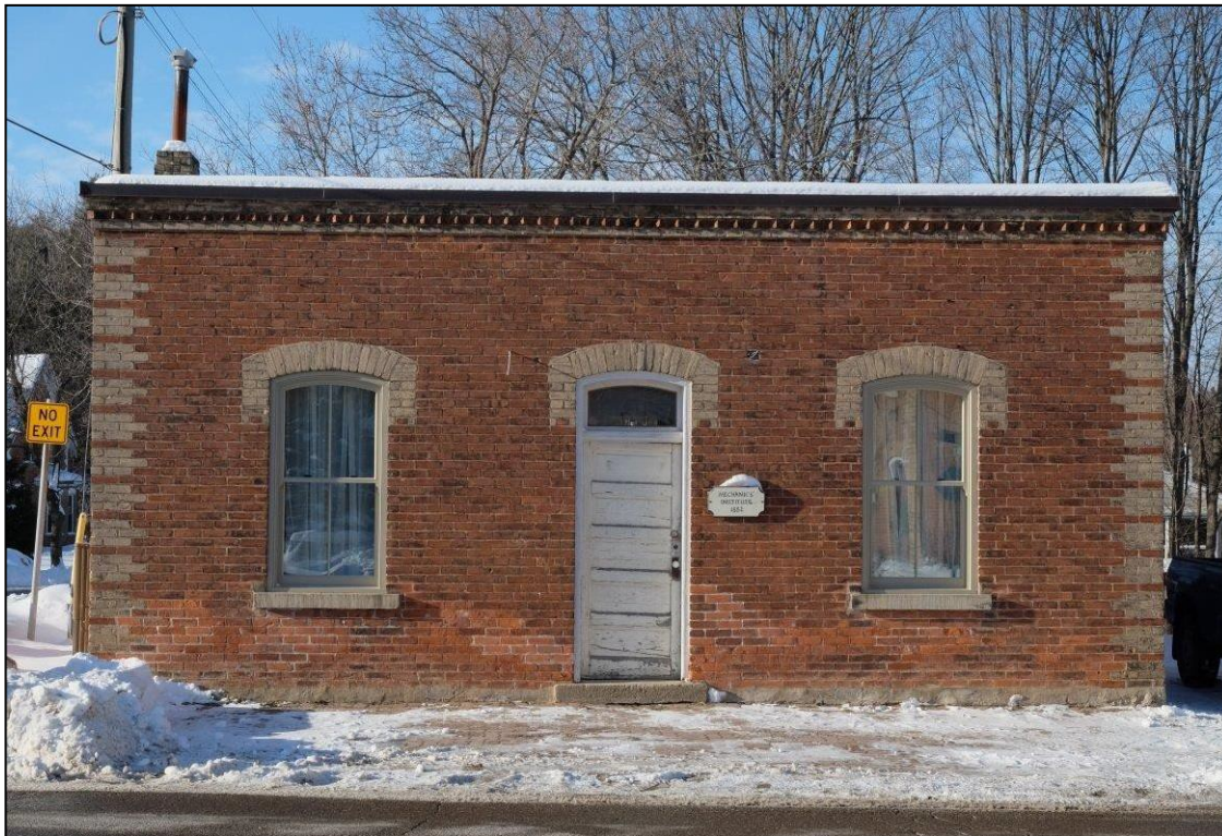
Alton Mechanics Institute: Repaired roof and associated flashing, repointed areas of exterior brickwork, restored windows.