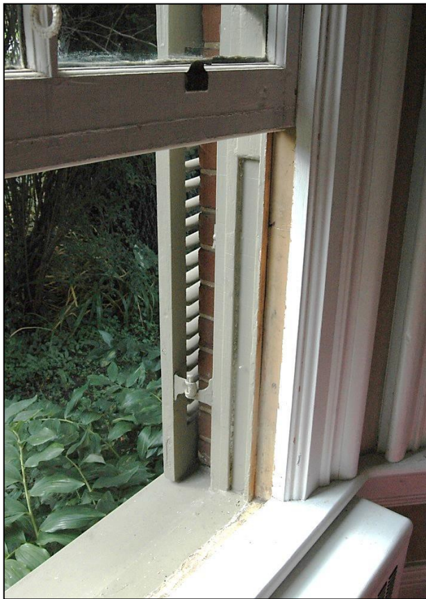
Goodfellow-Nattress-Potts: Replaced sash cords and installed weather seal on windows.