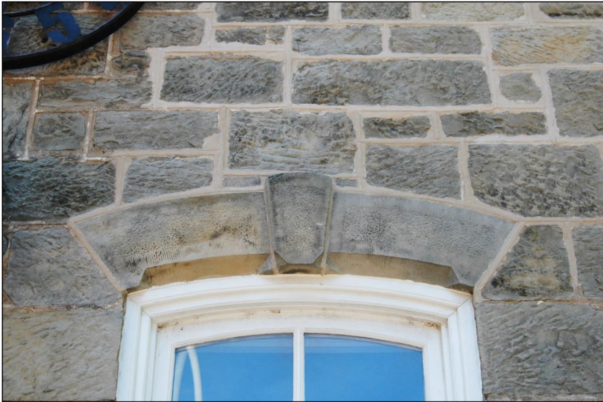
Sharpe Schoolhouse: Repointed areas of exterior stonework.