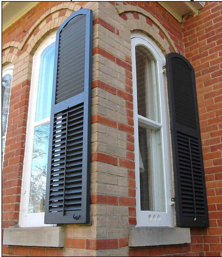
Little-Webber House: Repaired and repainted shutters.