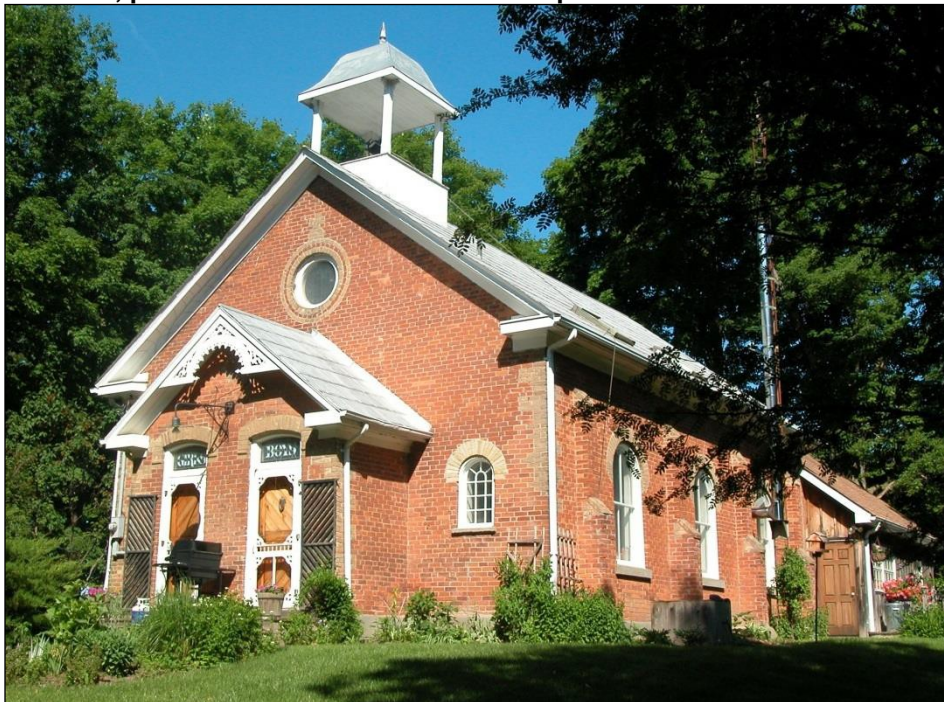
Silver Creek Schoolhouse: Repaired fascia, soffits, and bell tower.