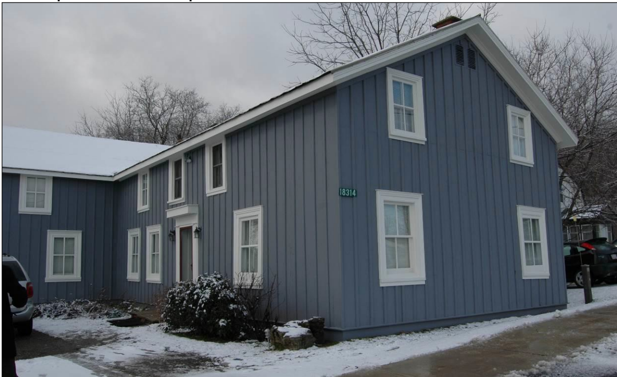
Caledon Village Creamery: Repainted exterior cladding and window trim.