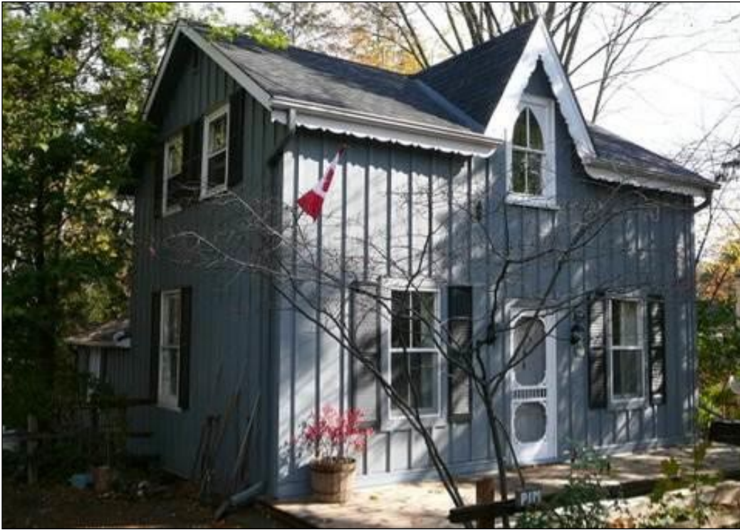
Graham-Wilson-Pim House: Replaced board and batten cladding on front façade.