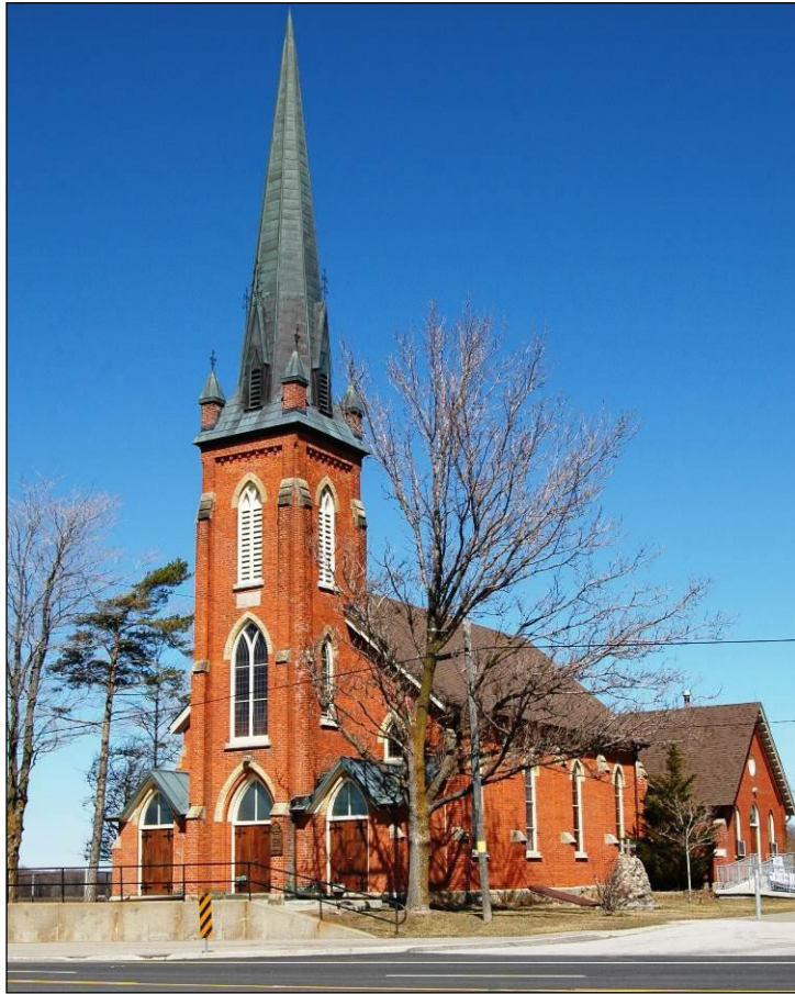
Claude Presbyterian Church: Repaired front gable fascia and soffits, painted exterior wood trim and exposed rafters in eaves.