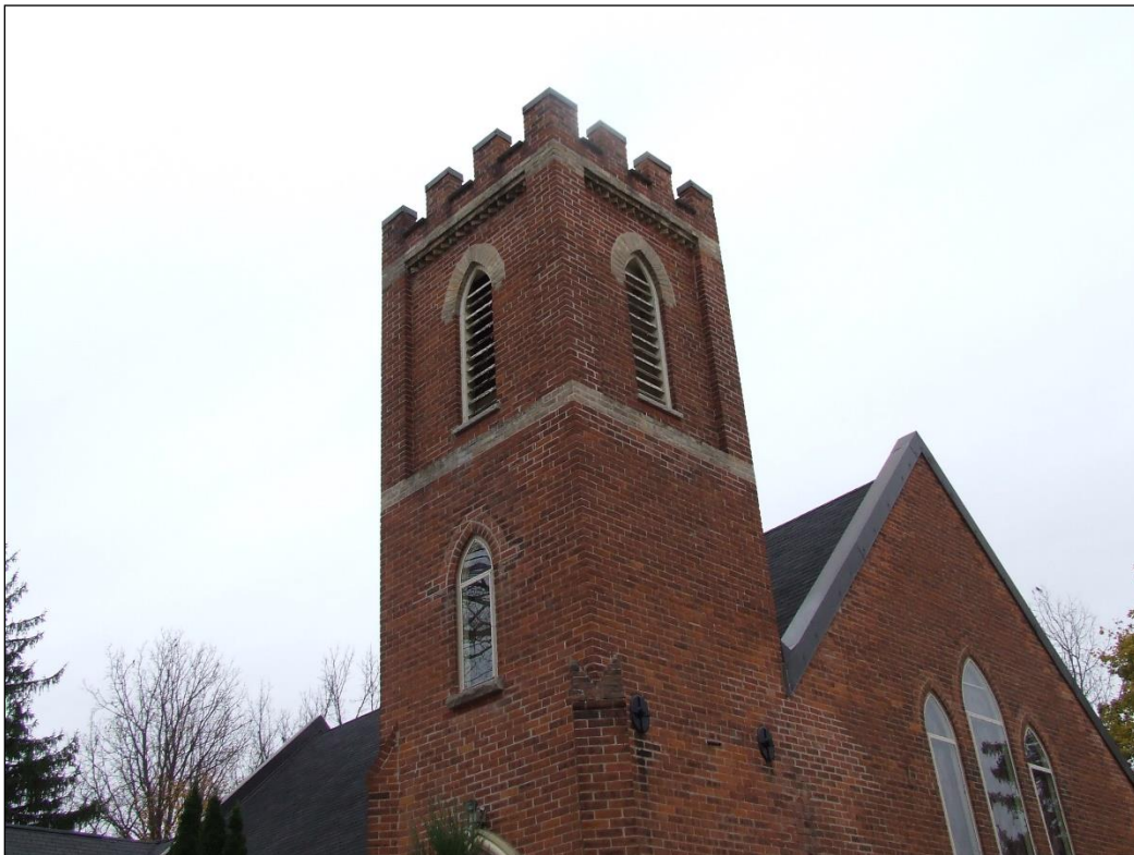
Bolton Heritage Conservation District: Repointed areas of Christ Church Anglican bell tower