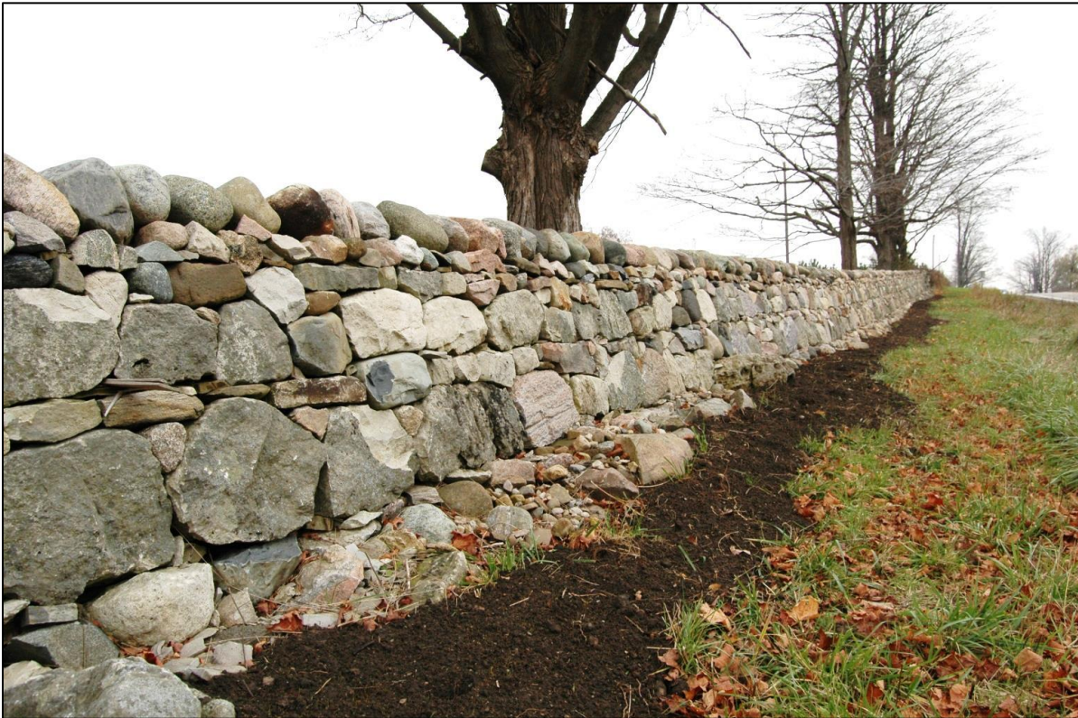
Patullo-McDiarmid Dry Stone Wall: Restored using existing stone and new cedar shakes.