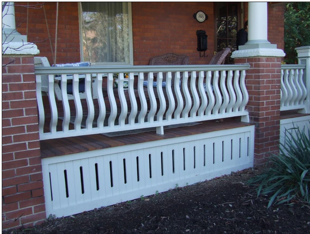
Bolton Heritage Conservation District: Restored front porch elements