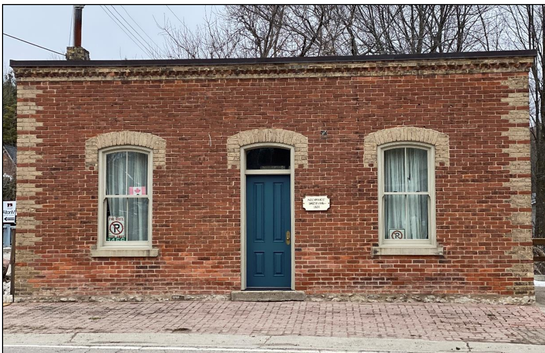
Alton Mechanics Institute: Repaired roof and associated flashing, repointed areas of exterior brickwork, restored windows and front door