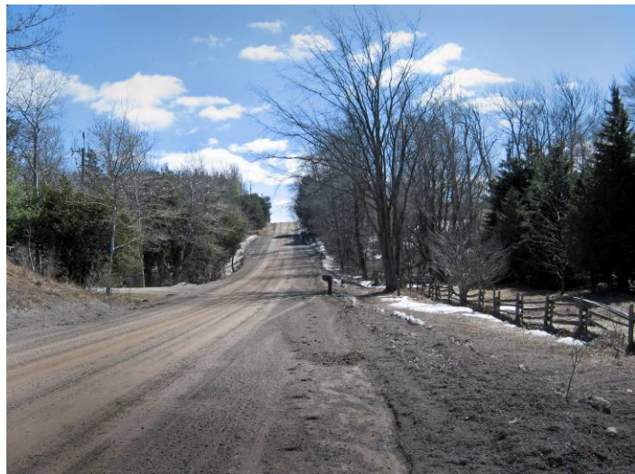
View along Coolihans Side Road

This area is characterized by the intersection of the Niagara Escarpment and the Oak Ridges Moraine, creating a series of ridges and hills running both north/south and east/west the latter containing the source of a number of the tributary streams of the Humber River. Early settlement was typically in plateau areas and along the river valleys. The difficult terrain, particularly in the northwest meant that some areas were never developed, or, if developed at all, were abandoned early for farming purposes. Thus Innis Lake Road never was taken through to Coolihans' Sideroad and yet is ideal as a section of the Bruce Trail. Generally, throughout the area, despite some severances, the prevailing sense is of isolated farms in a heavily wooded setting. Views to the northeast from the crest of Coolihans Sideroad are particularly dramatic.