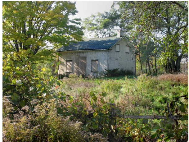
18030 Centreville Creek Road

This recently restored, small farmhouse, is constructed of rough-cast lathe and plaster over a square timber frame. The 1 ½ storey, three bay under medium gable roof form is typical of the pre mid 19 th century homes of the area. The end chimneys, returned cornice and moulded verge are also typical classically-derived details of this period.