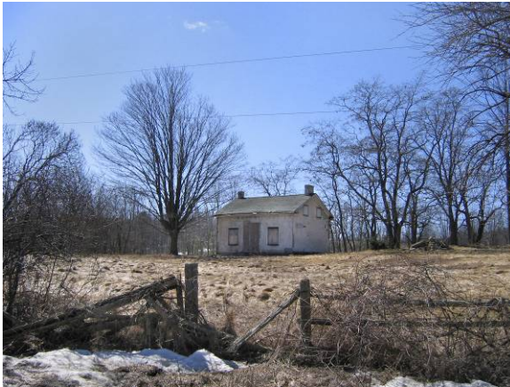
18030 Centreville Creek Road