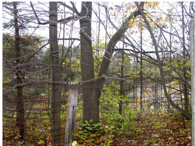
View of 19353 Glen Haffy Road

Known as ‘Briardale’ this excellent farm complex is comprised of a 1 ½ storey frame house of three bays with centre gable and full verandah across the front,