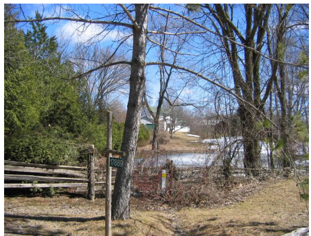
17889 Innis Lake Road

This property belonged to one of the earliest settlers in the area, James Killeen who, as noted earlier, helped to establish the hamlet of Sleswick. It is a beautiful well treed site with the house and farm buildings set well back from the road and two tributary branches of the Humber River running through the property. The