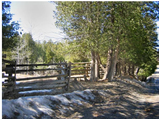
Cedar fence along Centreville Creek Road

The predominant property boundary and field delineation fencing in the area is of cedar, which grows abundantly. The typical extant fence type is cedar double post and split rail assisted with wire. There are also cedar split rail fences without wire, both snake rail and straight, as well as more relatively recent wire fencing with cedar posts. In the north end several horse farms have more contemporary board rail fences.