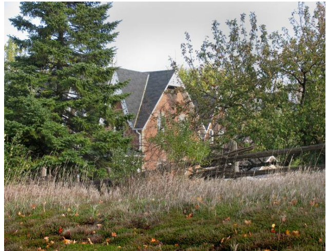
19179 Centreville Creek Road