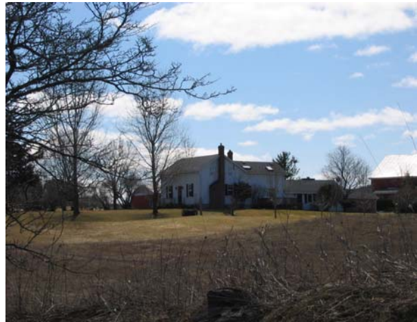
19126 Centreville Creek Road

Though this three bay medium pitched side gabled 1 ½ storey house may have new siding and windows etc., its form, scale and remaining brick end chimneys suggest it may be an original log house. It also retains extensive property including a river valley behind the house. The house appears to have been built by John McKedles c.1860.