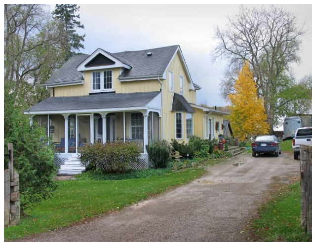
19350 Centreville Creek Rd

Board and batten frame three bay 1 ½ storey house with centre gable extending through 'broken' eave. The screened verandah across the front is segmentally arched between the chamfered columns. The building appears to date from the turn of the 20 th century. The property was in the McDonald family for much of the 19 th century.