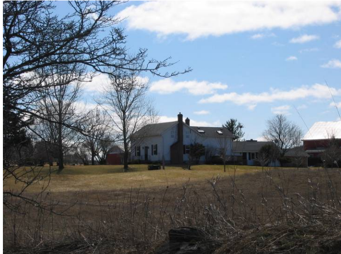
19126 Centreville Road

Still, despite the isolation, the settlers forged a sense of community. A school was established along the 1st Line (Innis Lake Road) by the 1830s. Though this section of road never evolved beyond a cart track, the original log building was replaced with a brick structure in 1872 and continued in use well into the 20 th century. Situated deep in a wooded valley, it became known as the Dingle School. Its