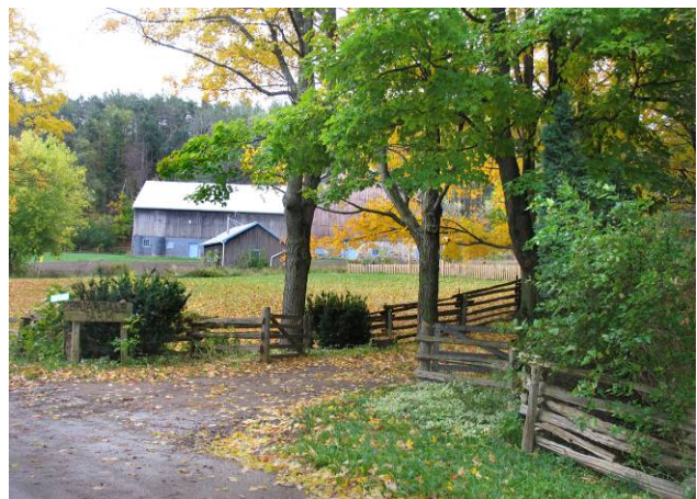
19560 Glen Haffy Road