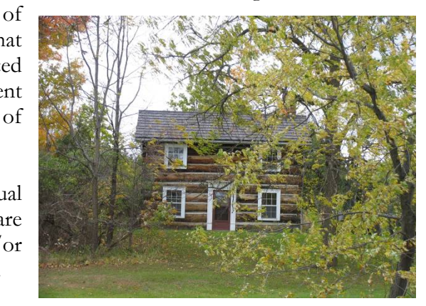
Albion Hills Bible Church

There are, however, as noted, a number of individual properties beyond the CHL boundaries which are certainly worthy of consideration for listing and/or designation including the log structures noted above.