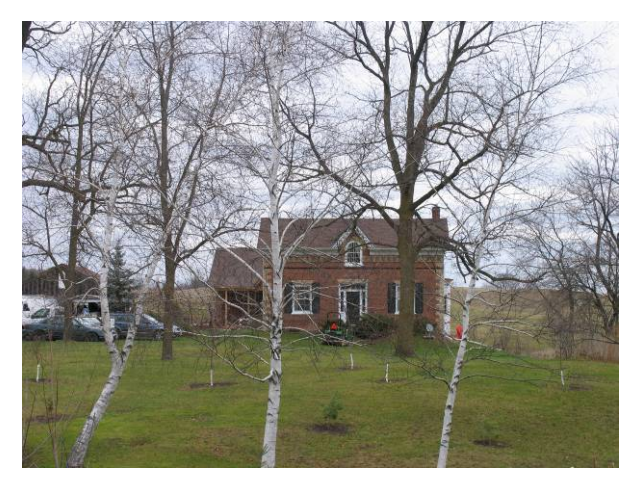
15629 Mount Hope Road