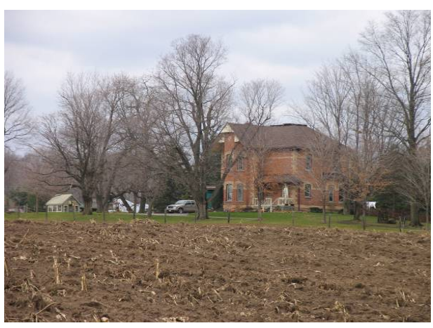
15674 Mount Hope Road