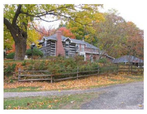
16775 Centreville Road

There are many fine individual heritage homes and/or farmsteads within the area, including a concentration of log structures along Gore and Centreville roads, south of Finnerty including 16775 Centreville, 16401 Gore ('Centreville House'), the Albion Hills Bible Church (17243 Gore Road), and 17416 Gore Road.