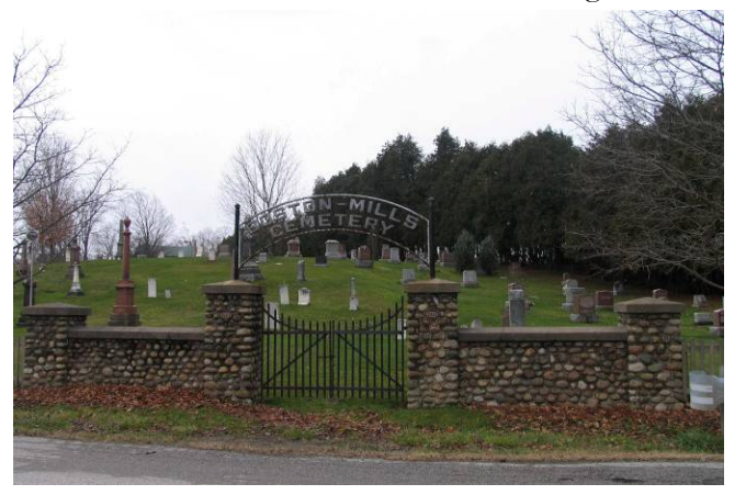
Boston Mills Cemetery

The area of the former village of Boston Mills (Chinguacousy and Boston Mills Road) was considered a possible Candidate CHL. There are certainly a number of interesting natural and cultural features still associated with that general location -where the Credit River is bridged across