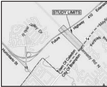
Kennedy Road Improvement: Study Limits

Wednesday, September 13, 2006, 5:00 pm to 7:30 pm Mayfield Recreation Complex 12807 Bramalea Road, Caledon, ON