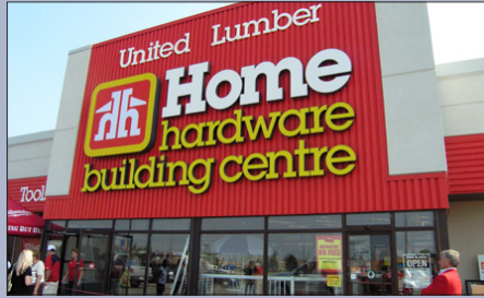
United Lumber 12833 Highway 50, Bolton www.ul-hhbc.hhstores.ca