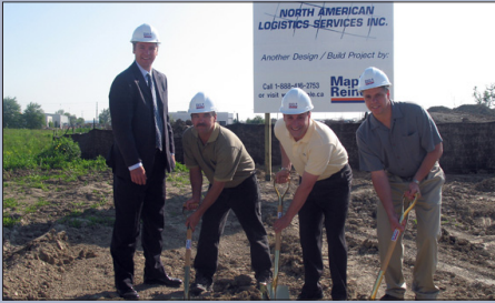
North American Logistics Services Inc. 49 Simpson Road, Bolton www.nalsi.com