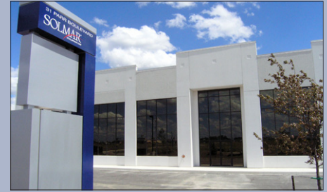
Cosentino Wholesale Fruit Co. Ltd 31 Parr Boulevard, Bolton www.cosentinfofruit.com

Empire Theatres-Bolton officially opened on July 8, 2007. Empire Theatres is a subsidiary of Empire Company Ltd. - a diversified company whose key businesses also include food distribution (Sobey's Inc.), real estate and corporate investment activities.